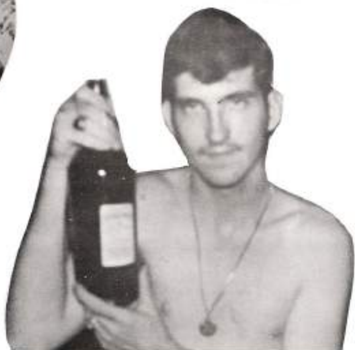
It's, it's, it's empty.