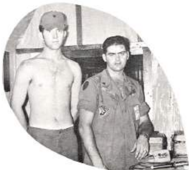
Keep it behind your back until they leave.