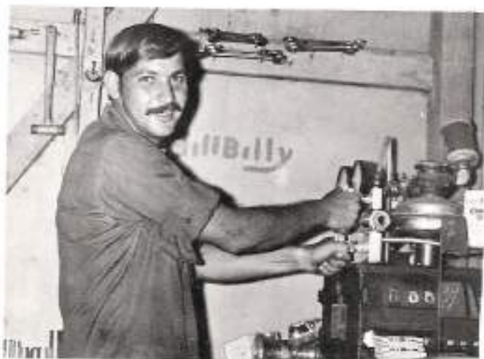
Damn if I know what it is!