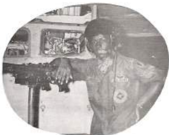
You say I did what ?