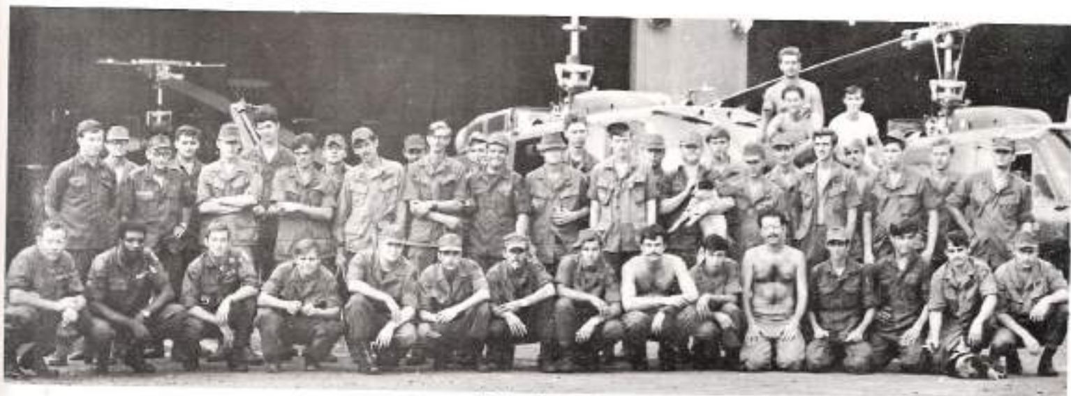
175th Hanger Rate