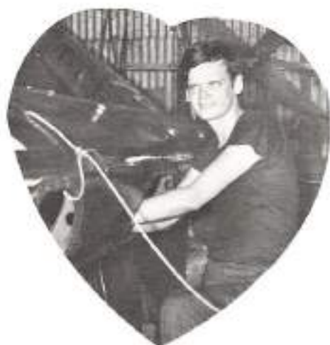
I feel so good when I put my hand in a hole.