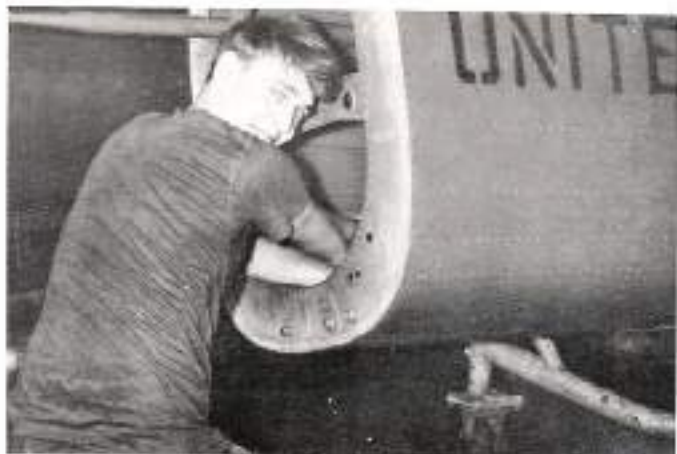
This looks like a good hiding place.