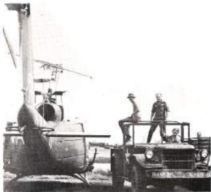
I am waiting for the P.I., Sir!