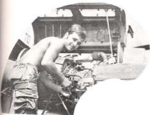
I done it again! It's fixed.