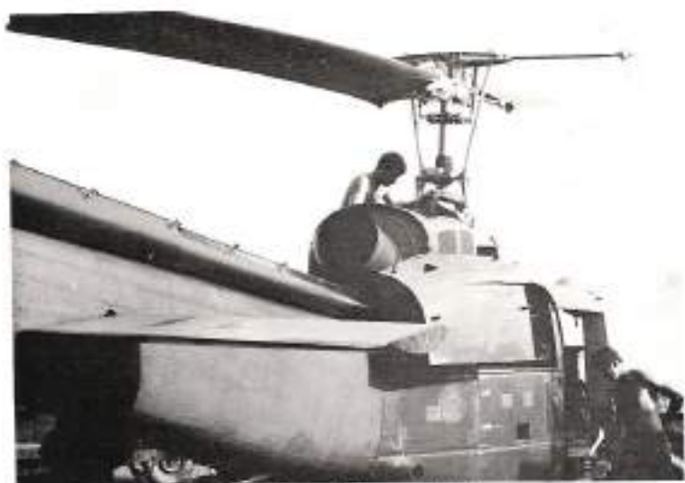
"I wish I could go fishing" what a can of worms?!