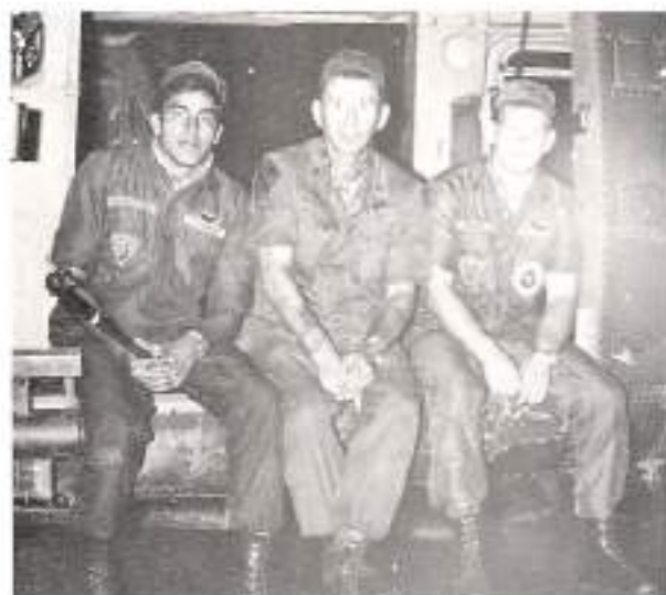
Three bund nice