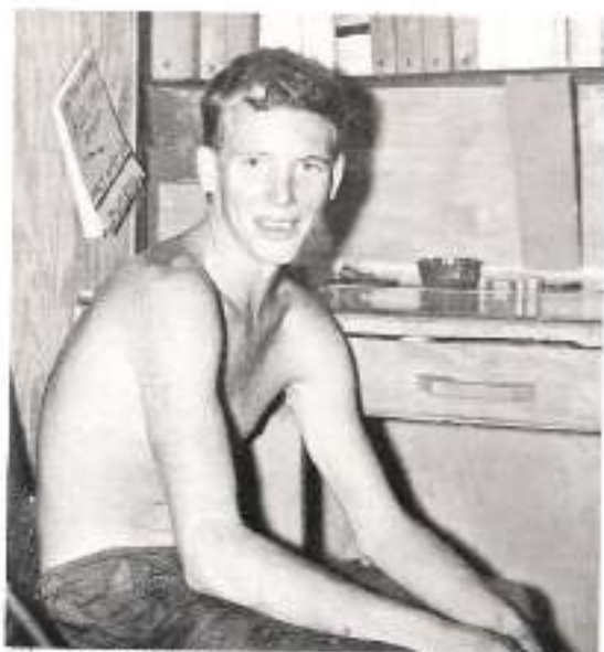
Steam bath was really that good.