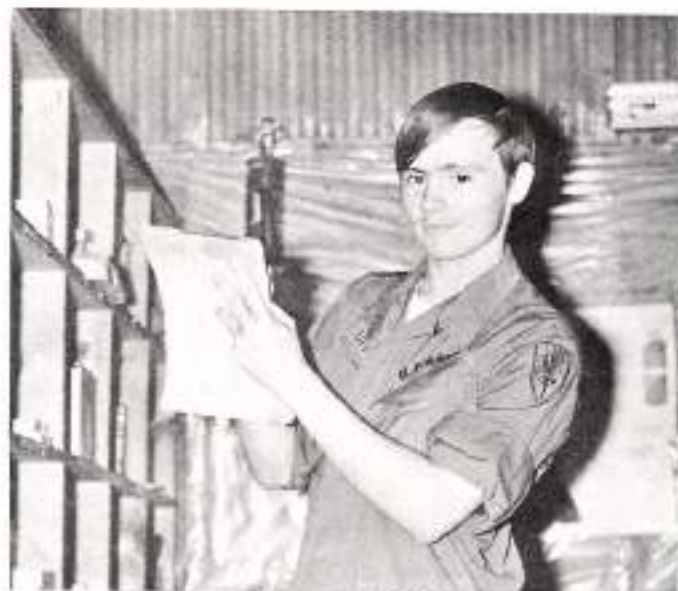
You want C's?