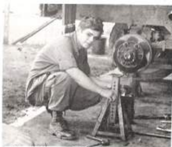
Three days and I'm still trying to get the wheel on.