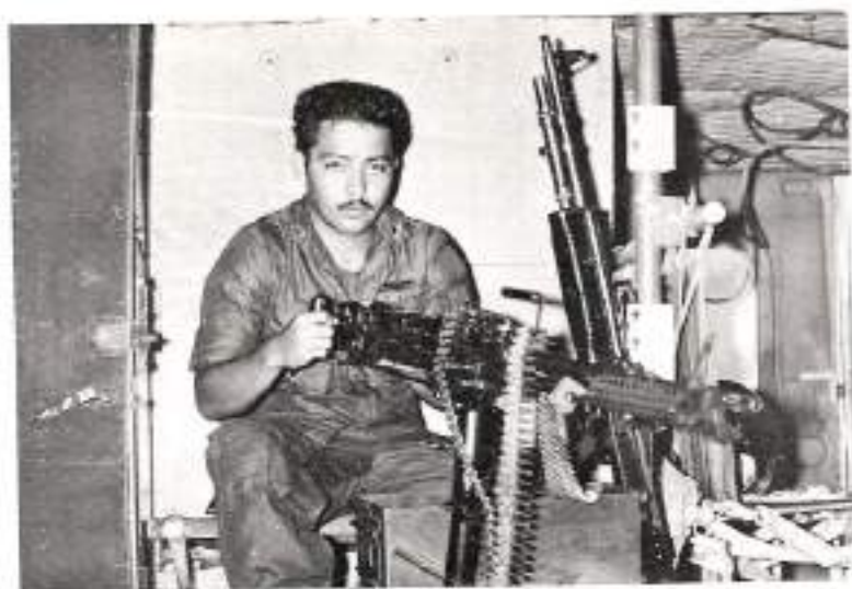
You buy felthy pictures or else...