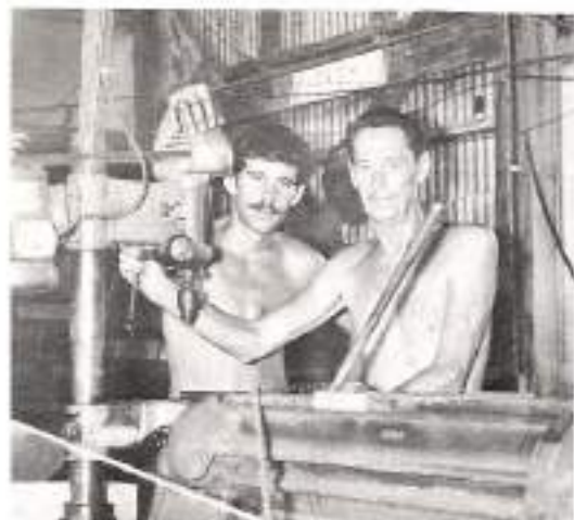
You are right, I should have put that drill bit in.