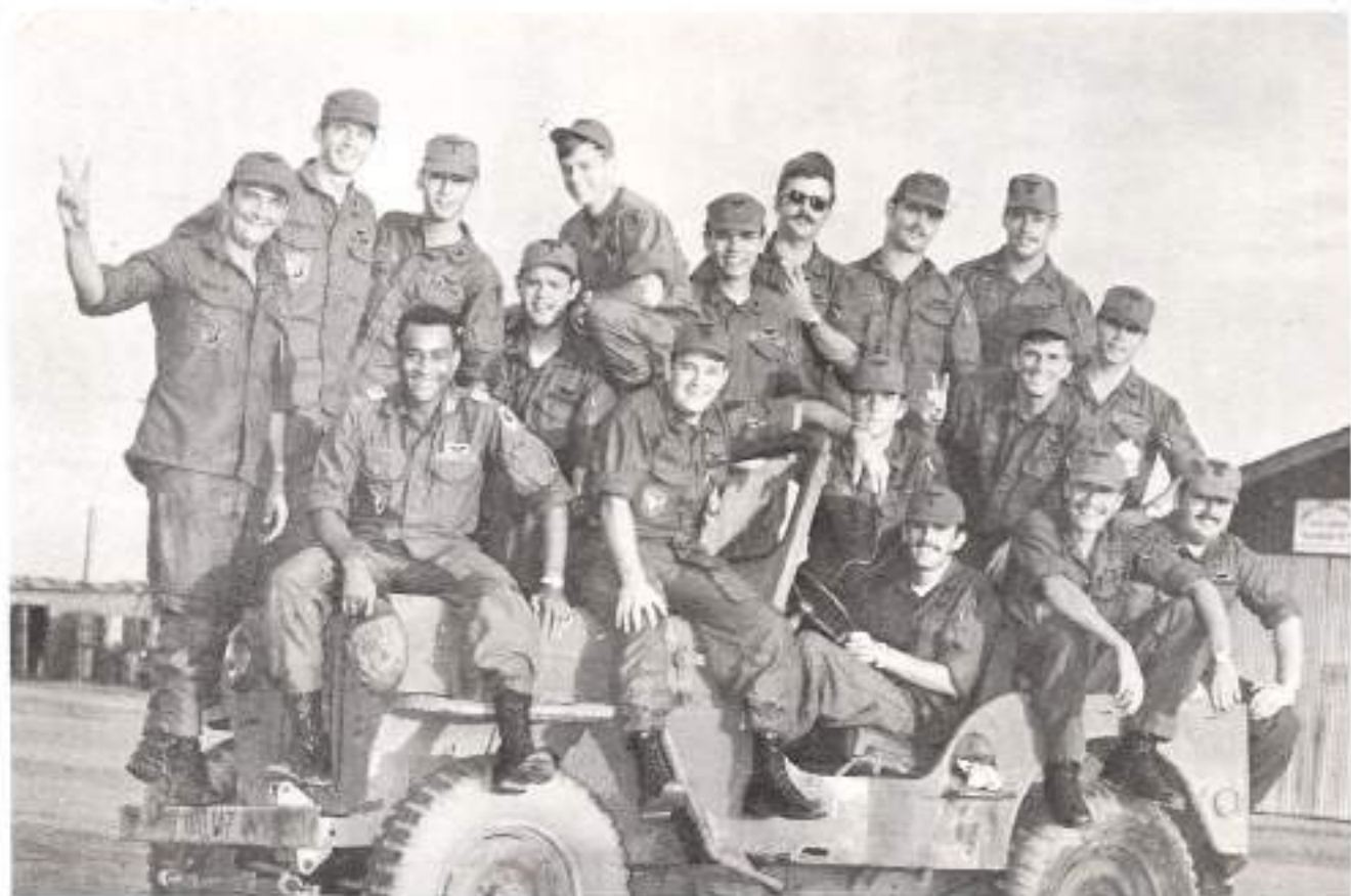
The sensational seventeen plus