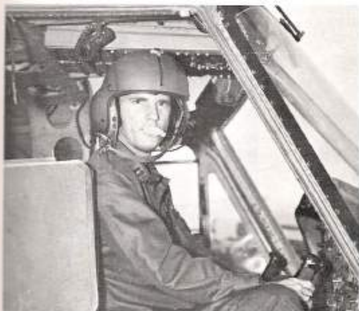
Vinh Long Tower, OI....uh, uh!