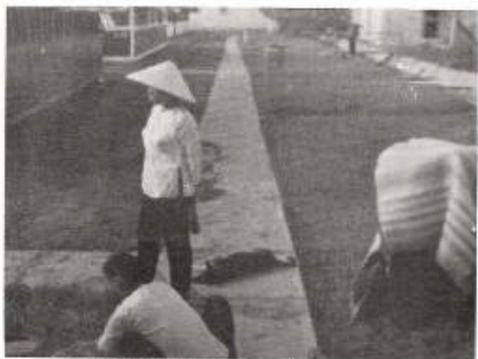
Now if they come in this way...