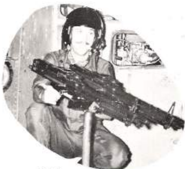
Double shot of my babys love.