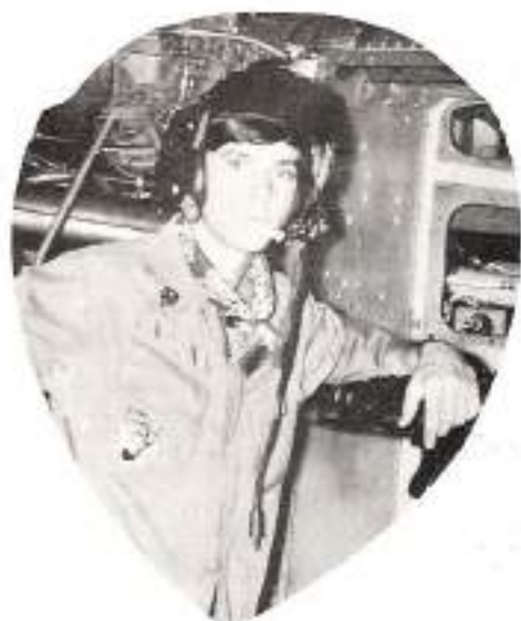
Because it looks cool.