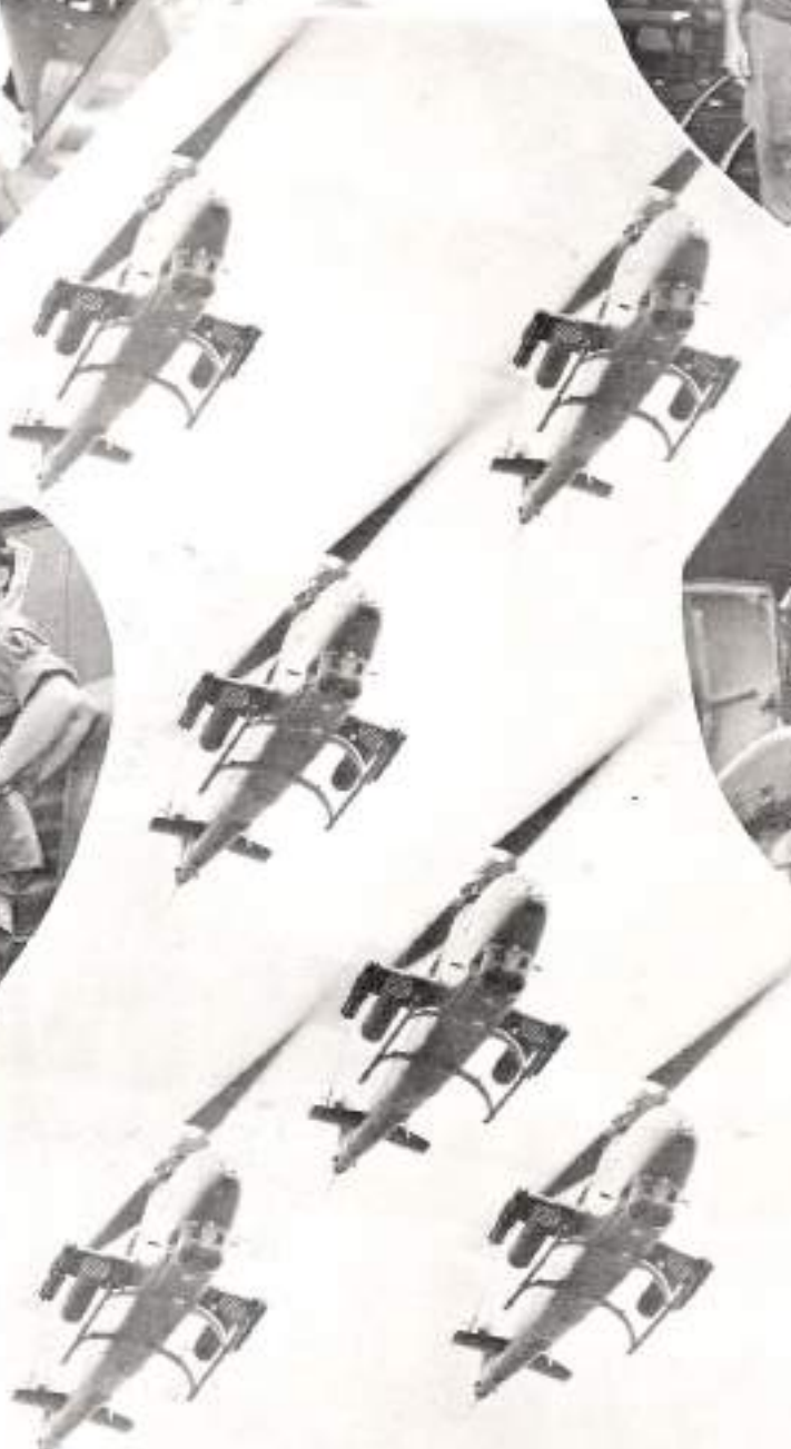
Six at once?