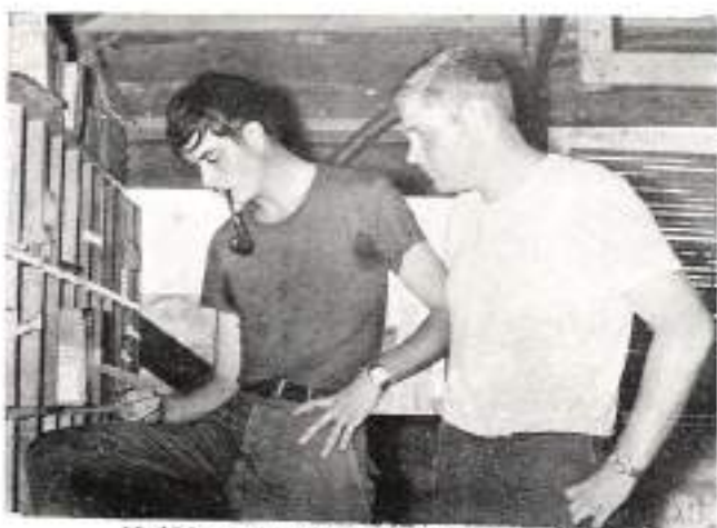
We'll substitute this one, they won't know the difference.