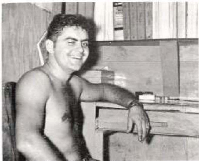
I just came from the steam bath.