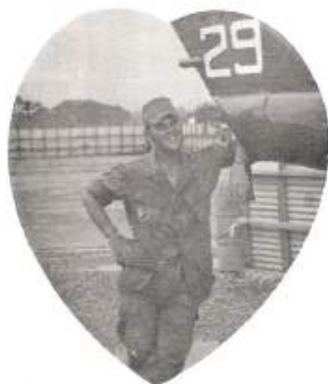
This is the best looking part of my Rag.