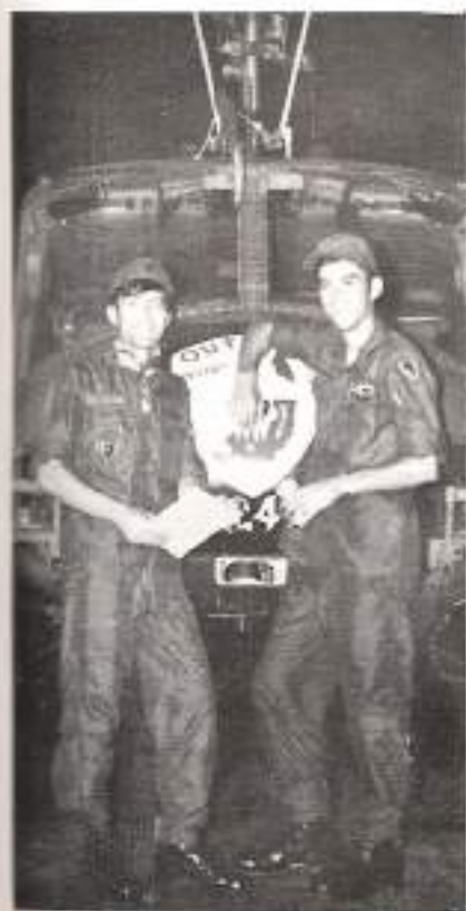
Flatdicks on parade.