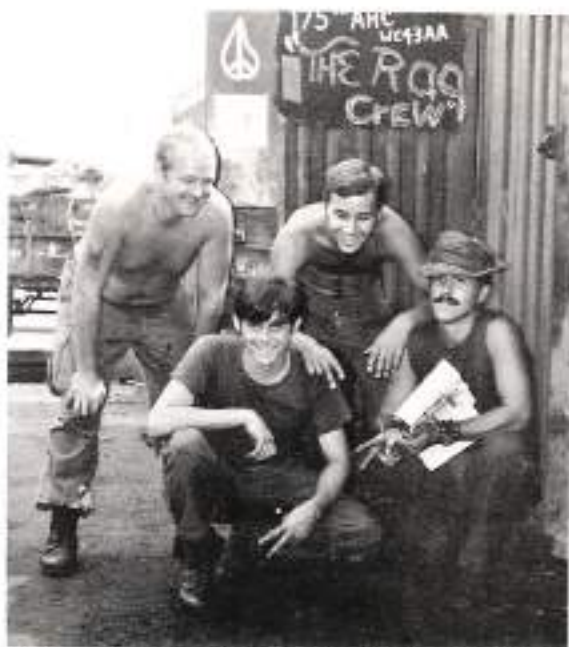
This better not be a monthly occurrence.