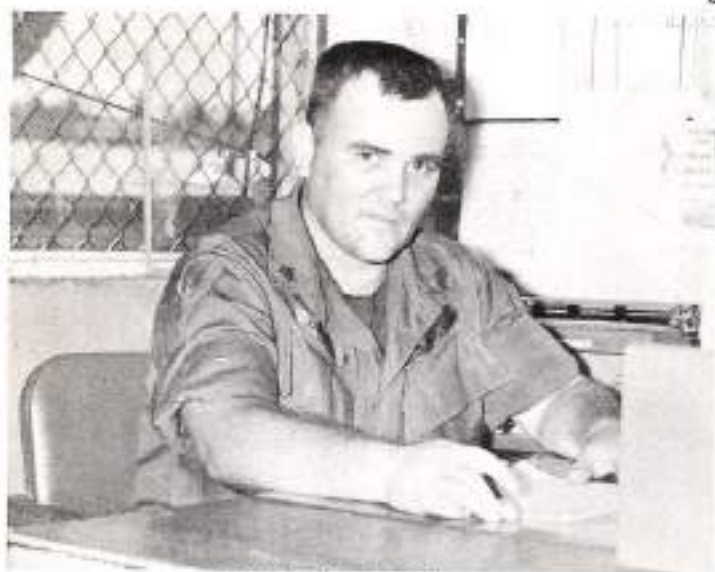
No!!! We don't have any.