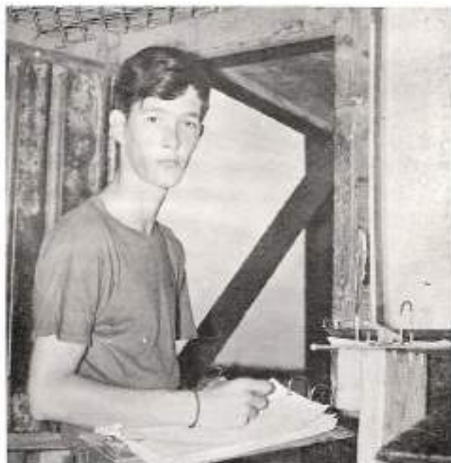
What orders for Can-Tho?