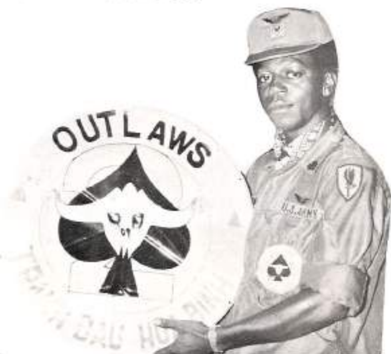
Fight to end war.