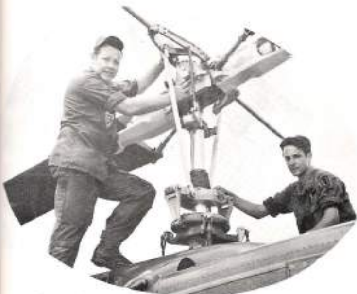
Push a little harder, sir! And that should fix it.