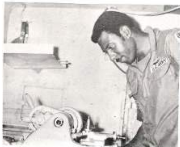
If Tech Supply can't get it, I'll make the damn thing.