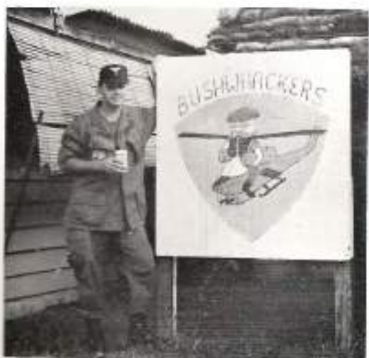
The only time I smile is when women and kids are running in the open.