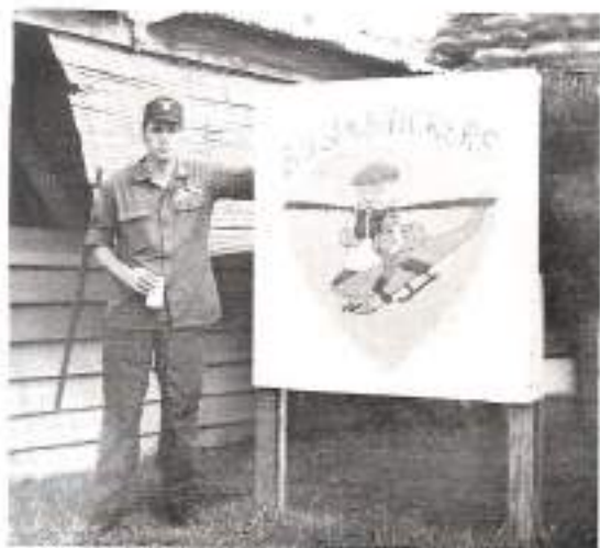
I'll trade you 2 cases of Bud, this original painting, and 1 S&S for.....