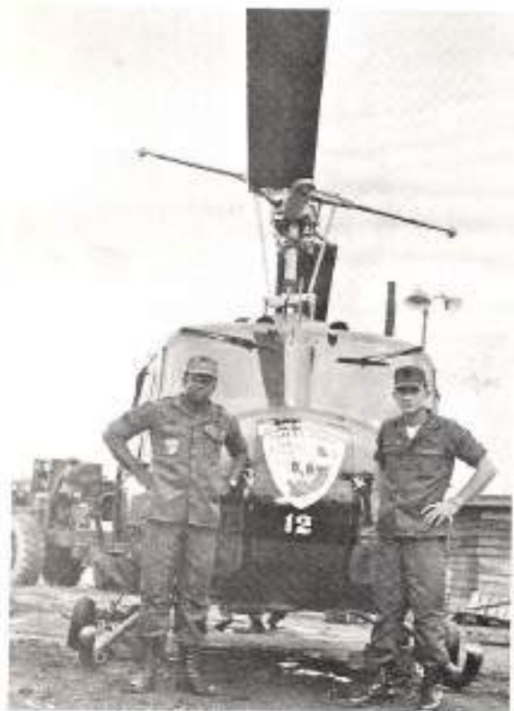
I thought you had the key!