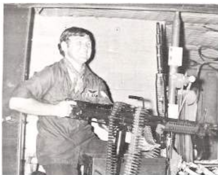
When I hold it like this, I can bounce brass off the Peter Pilots Helmet!