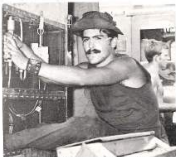
If it doesn't go in right, kick it!