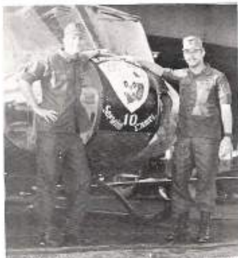
Will the new 10 please stand?