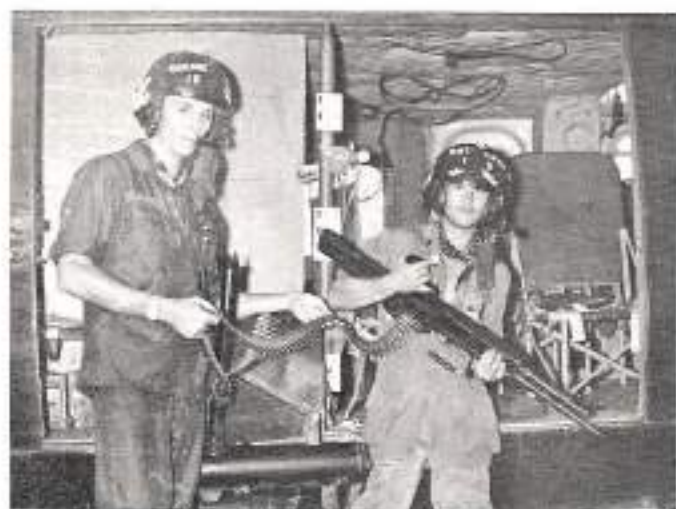
This works until the barrel gets hot.