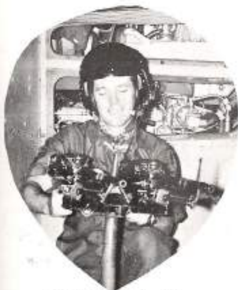
They usually don't work.