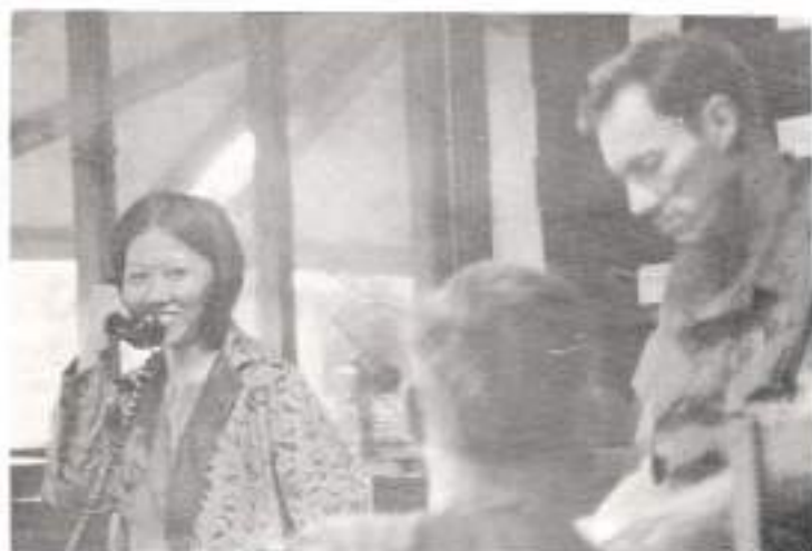
Hello, mom? I got the job!