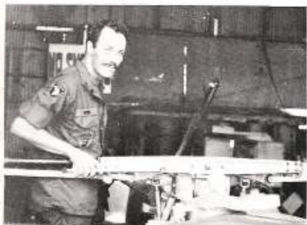
It better be OK, who fixed it?