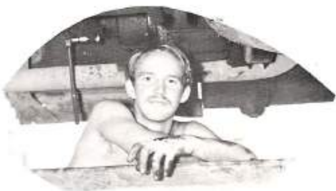
Guess what? I have been caught.