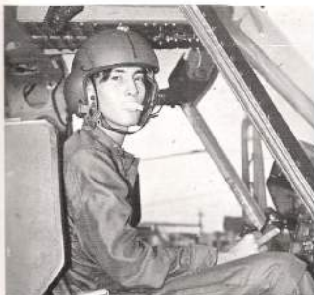
That's no way to hold the cyclic.