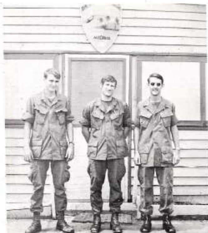
Lets go back inside where its cool!