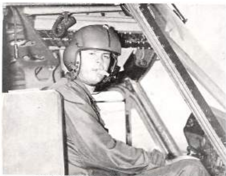
I wonder why the radices don't work?