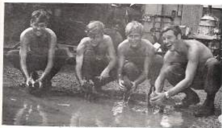
Duck Races at the Hanger?