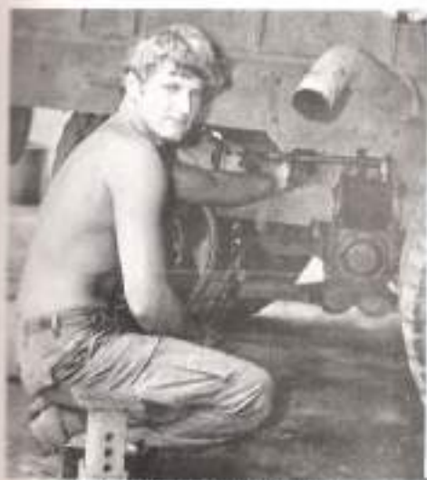
Look mom, one hand!