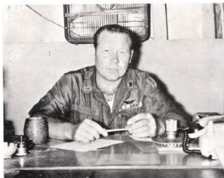
CPT Bill isn't here now - what can I change?