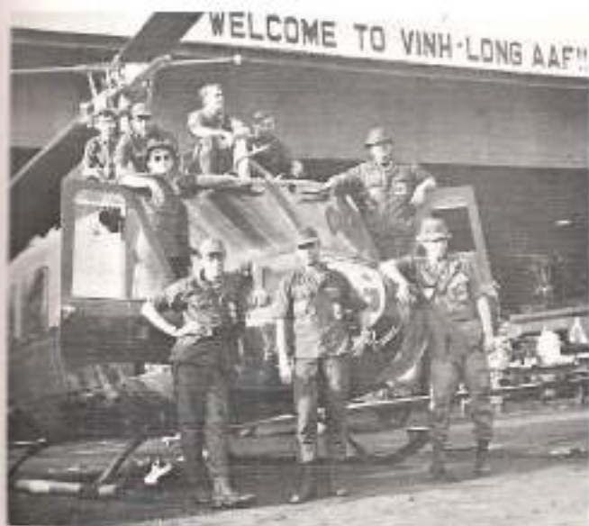
Ok everybody, look casual!