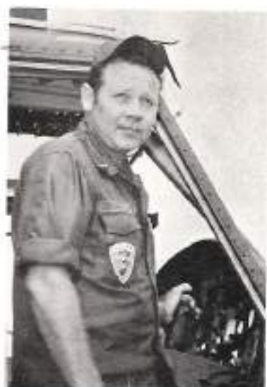
I made it again, what's next?