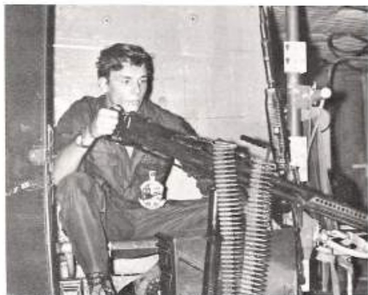
I wonder if I can hit the fuel cell from here?