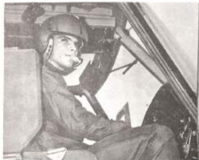
It's suppose to turn.