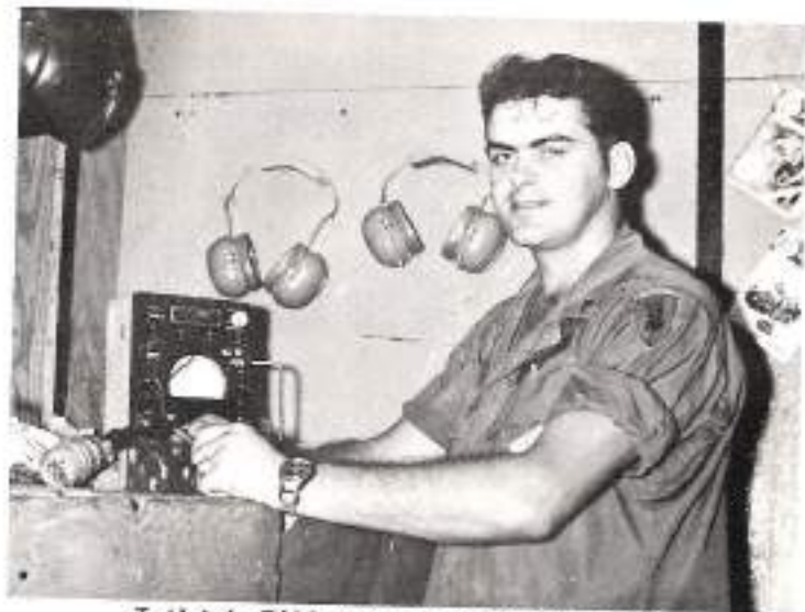
I think I'll go to the steam bath.