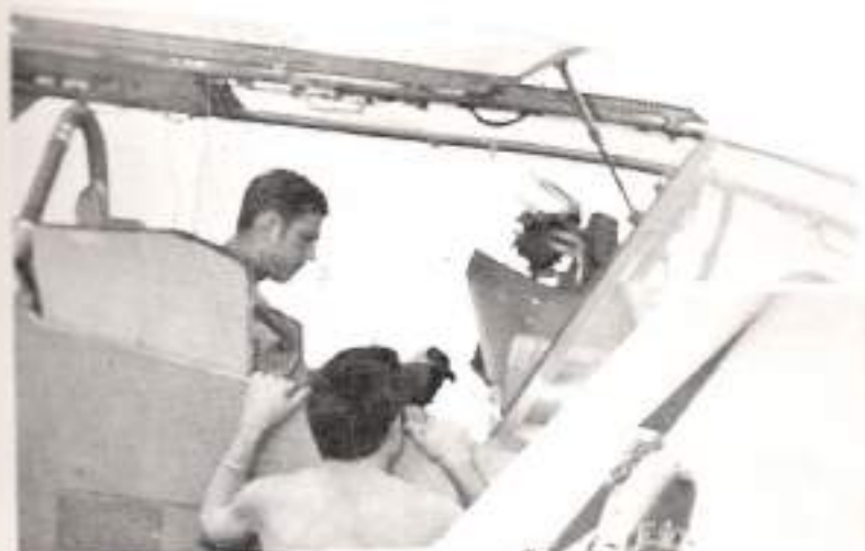
I think I remember how to start it.