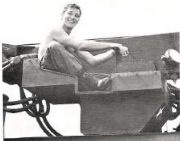
How about that, I didn't drop it.