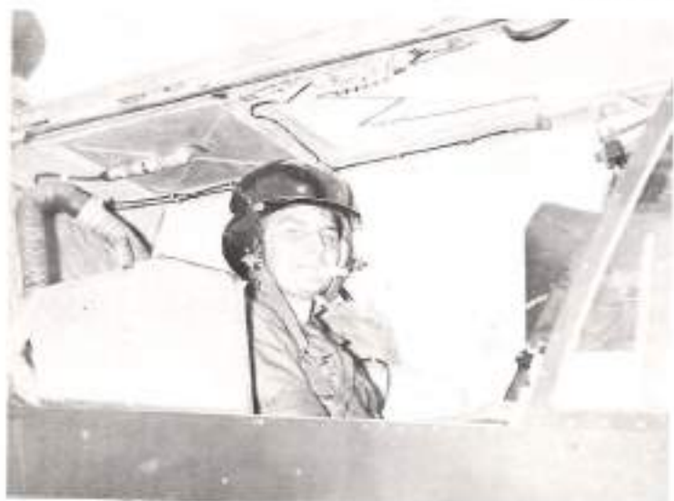
Watch me down this aircraft!