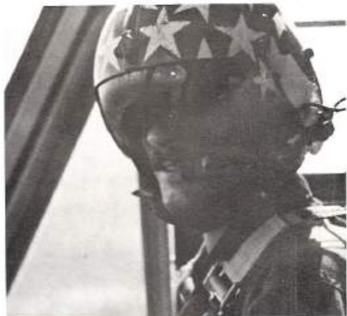
Who sees stars?