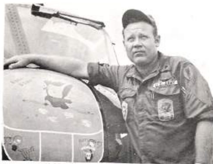
Well, I don't see any clouds. I guess I'll go on that recovery.