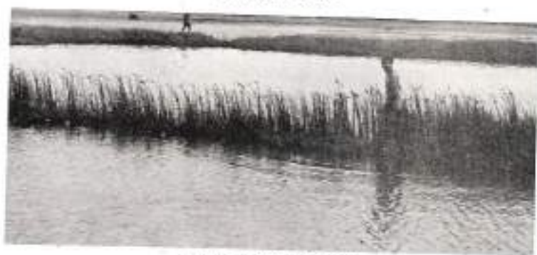
Duck seasons over