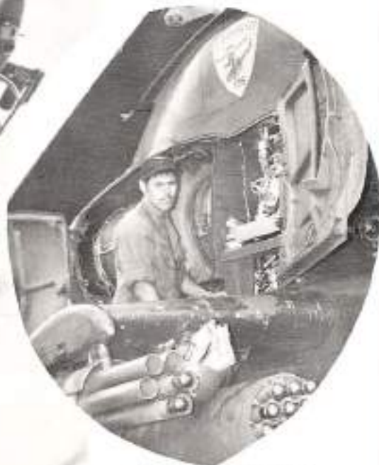
What sounded like three rockets firing?