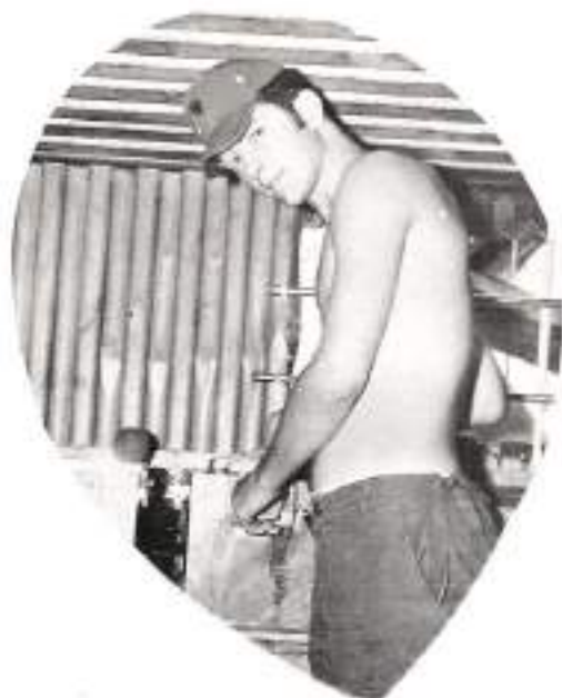
No, you can't look inside.