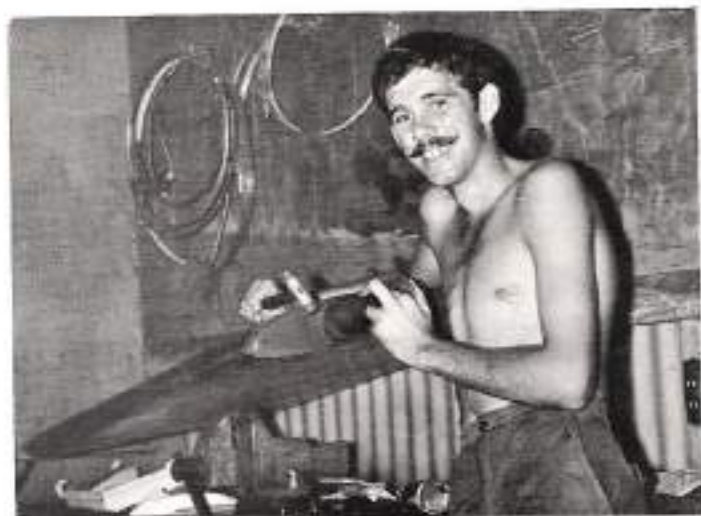
I know! I'll get a bigger hammer.