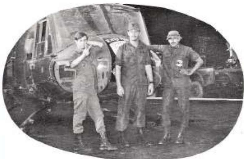
Pick the deserter.