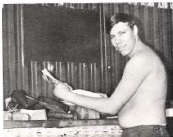
Man, I an looking for something.