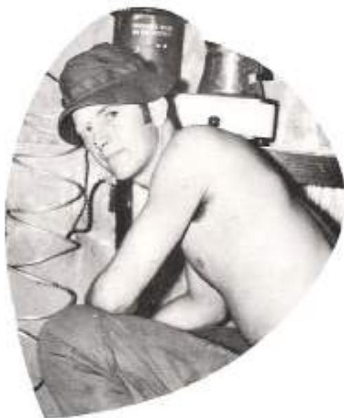
I bet you think this is disstilled water.