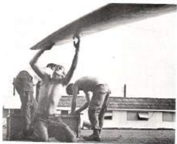
Oh, mighty blade in the sky please grant my wish.