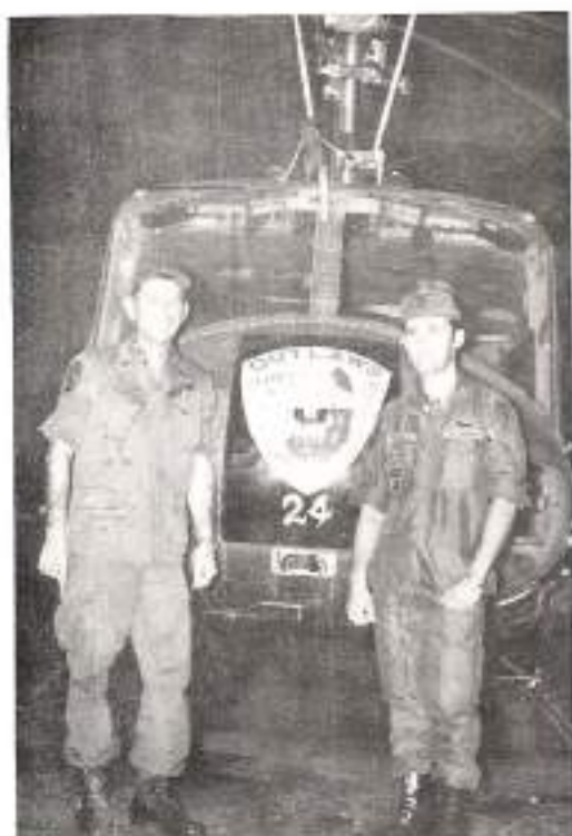
You better smile this time.