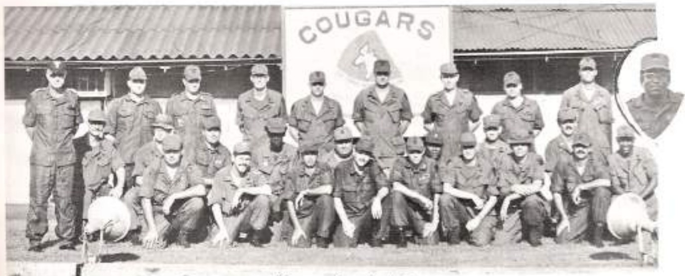
"Cougar 6" and staff