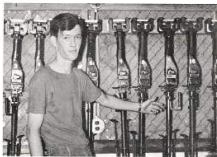
This? Oh, an M-60 or something, you want one?