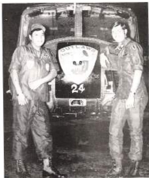
The next 24.