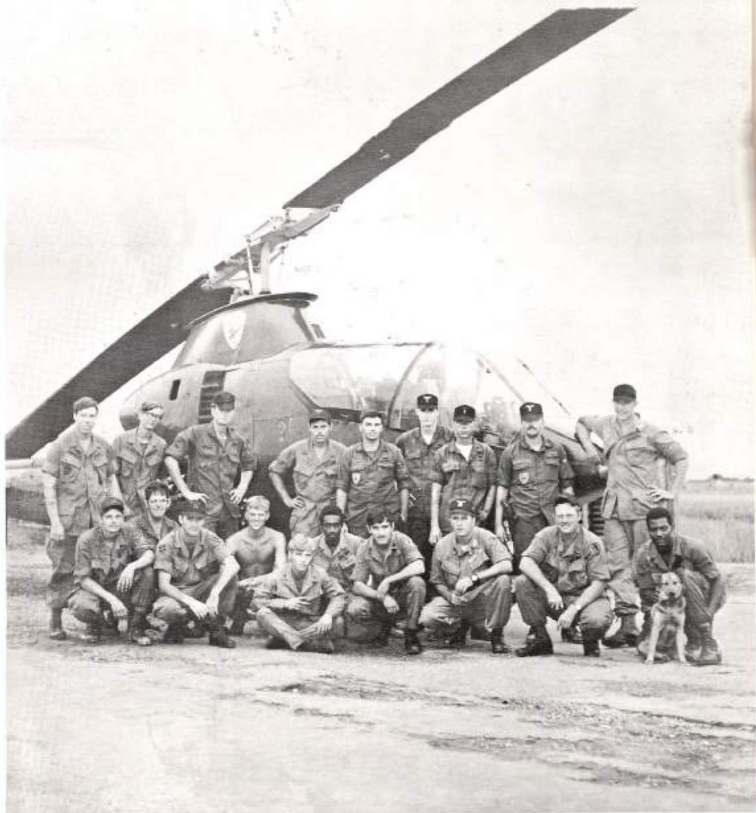
The Fabulous Bushwhacker Gun Team Fighters of Communist Agression in the Delta. Defenders of peace, freedom, and the American way.