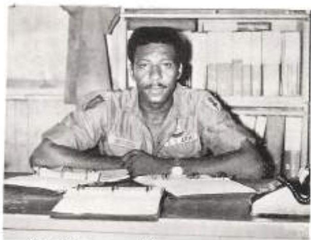
The T.M. says 60/1000, flush it and fly it.