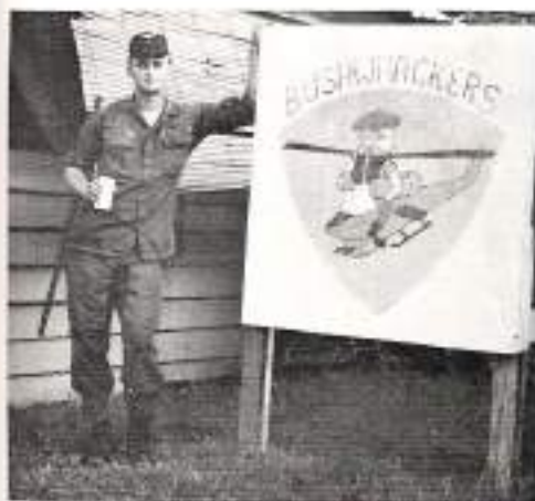
The king of beers