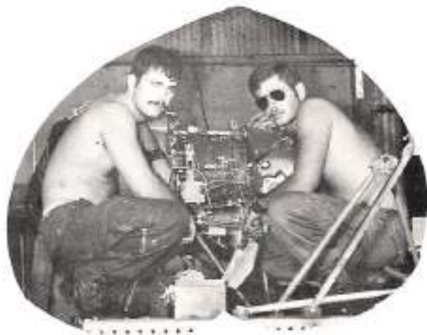
Hey, you are the maintenance officer! what is this thing?