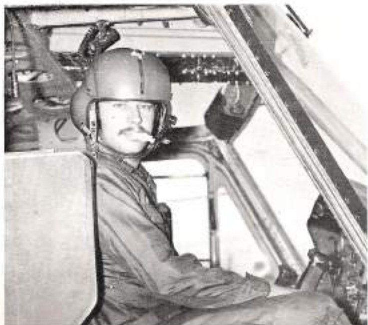
Ho Chi Minh lives.