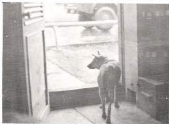
This weather ain't fit for a DOG .