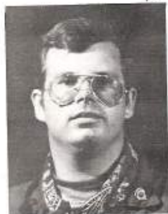
SP5 KLINK 12C