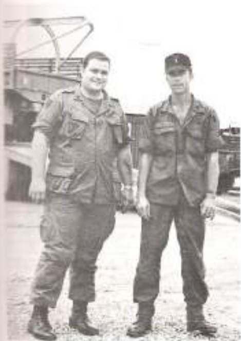
Slim & Spud