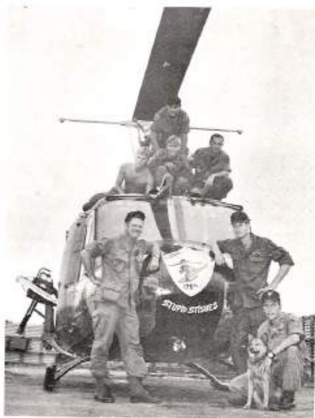
Gun Platoon's Slick