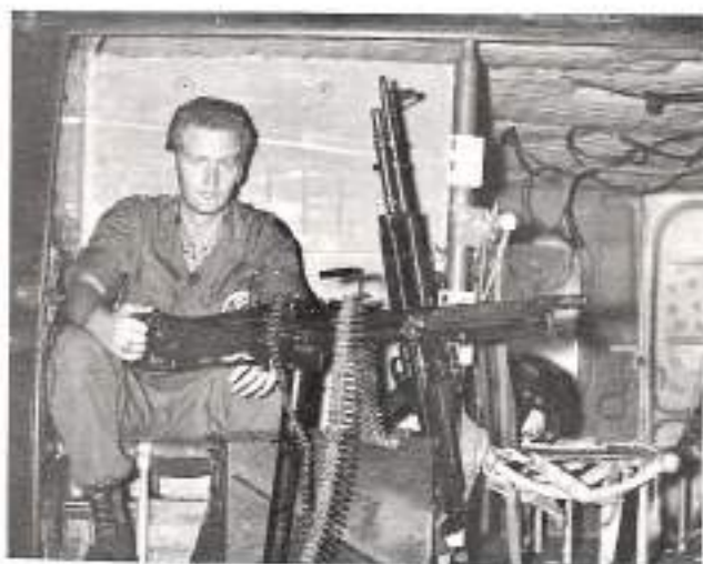
I take my job dead serious.