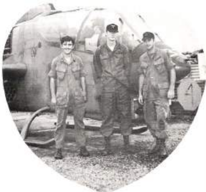
Dan's on leave - no one will notice the difference.