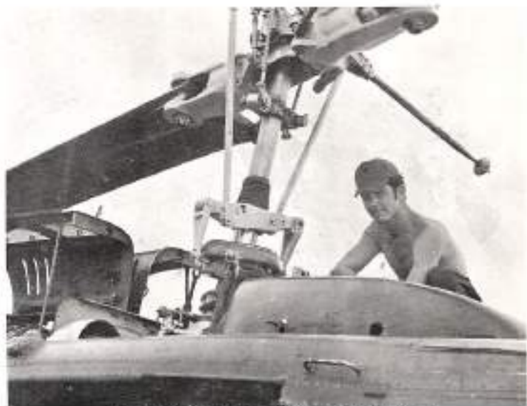
How much tongue 20" or 100" lbs?