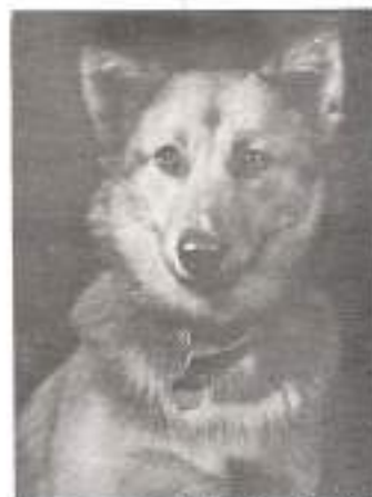
SHIELA DOG (Flt Sgt)