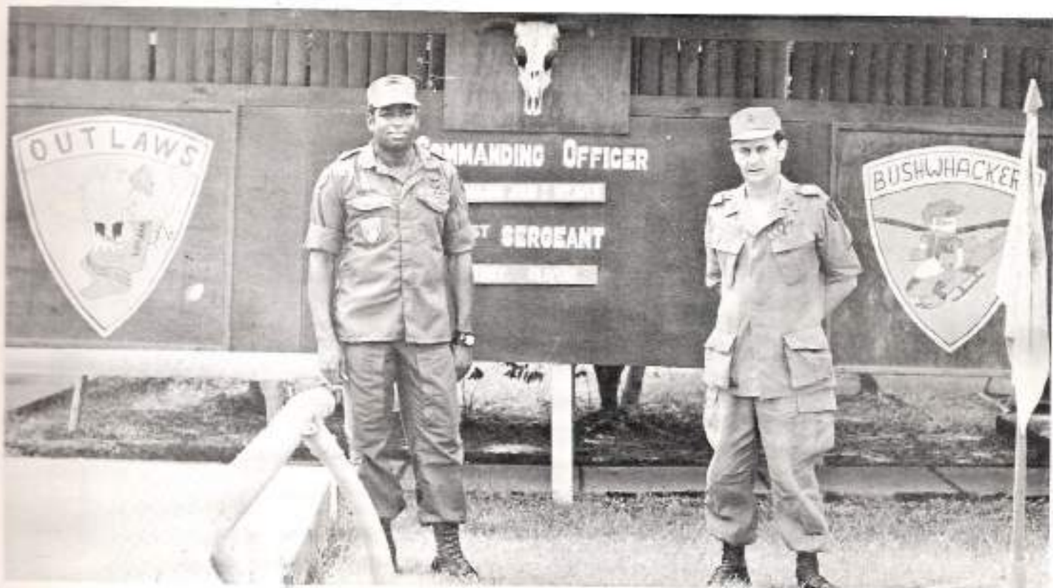
6 and 6 Alpha