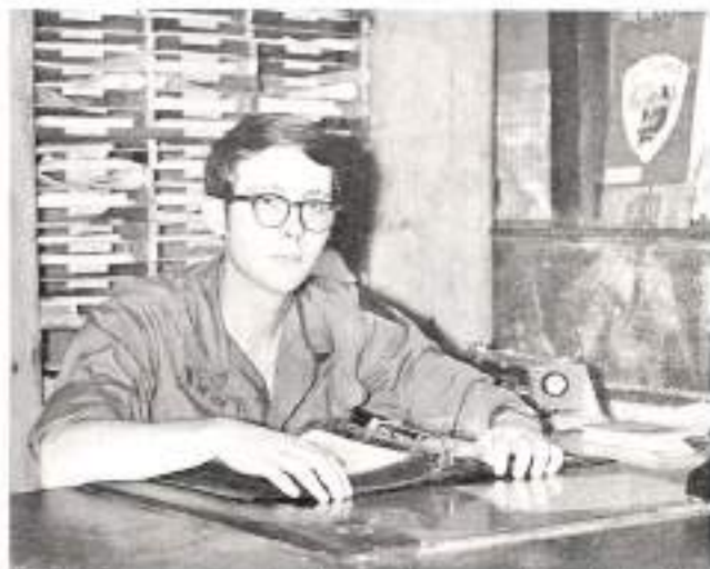
Don't have any, don't want any, haven't seen any, not expecting any, now what was your question?