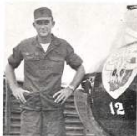
I am the X.O.