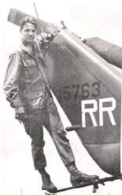
I guess it's good for a couple of more hours, sir!?