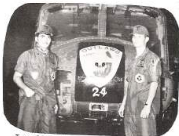
I would much rather crawl in the mud.