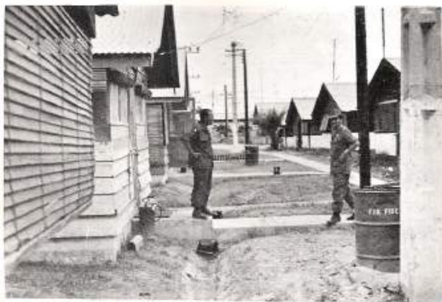
Not again, Top!