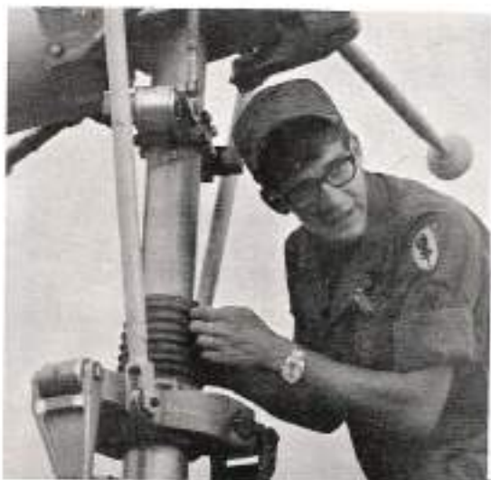
You can't fly this, your frammis boot is brushing against the Helmos generator.