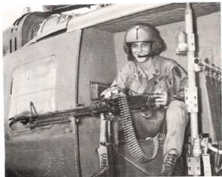
I have never been on a flight, but I look good.