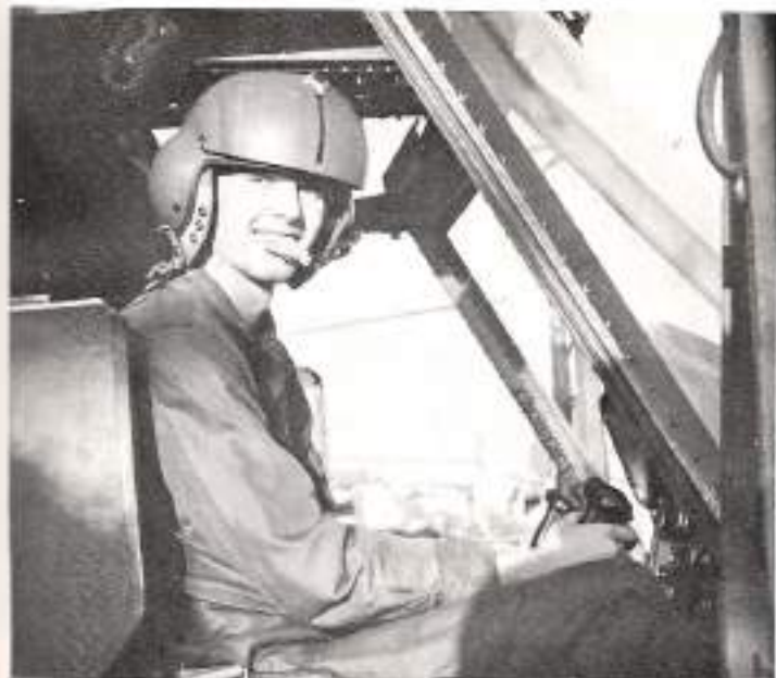
Feels like a.....