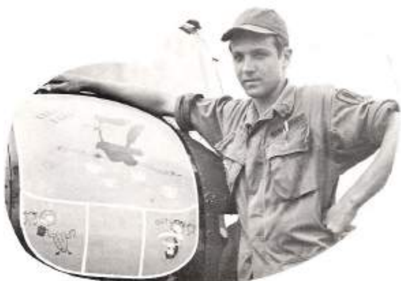
Touch me not