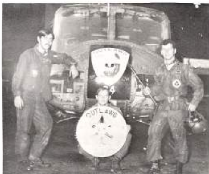
I usually carry two guns.