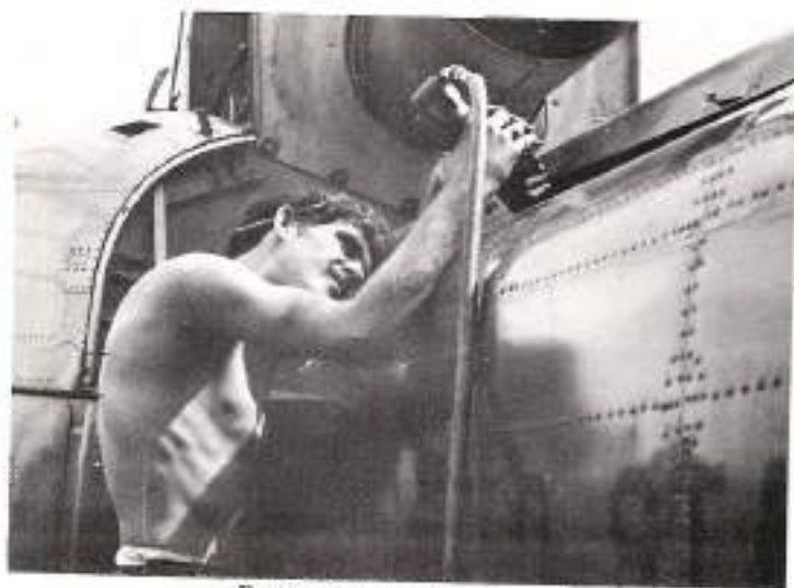
Best can opener around.