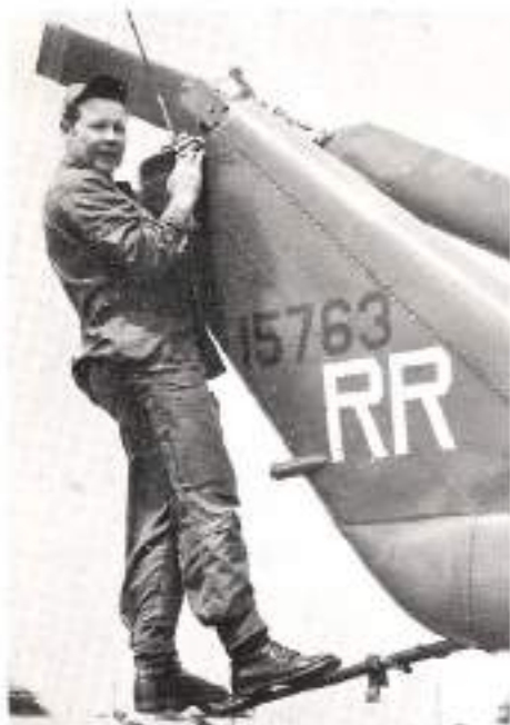
Operations, this is 44.