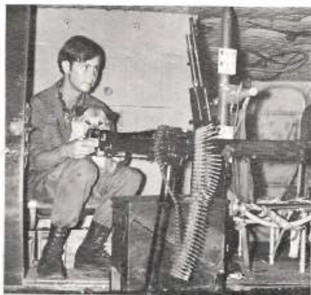
Some people need Teddy Bears...