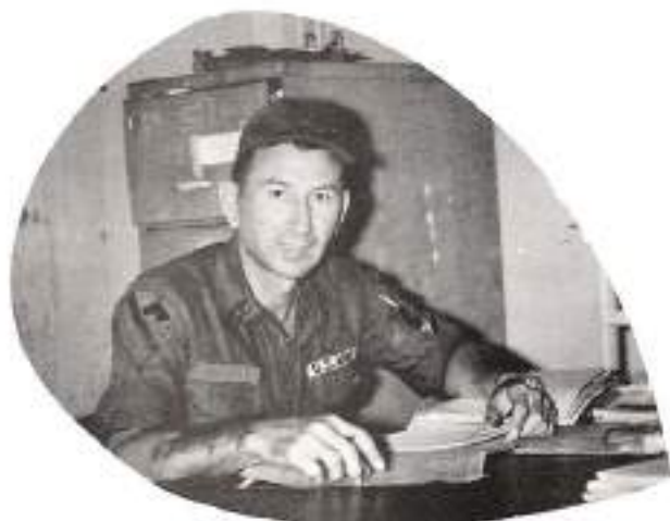
Of course this is the best platoon.