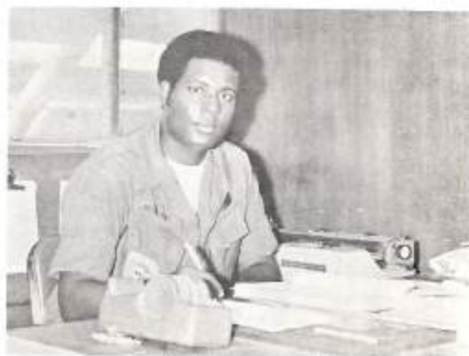
What is an award?