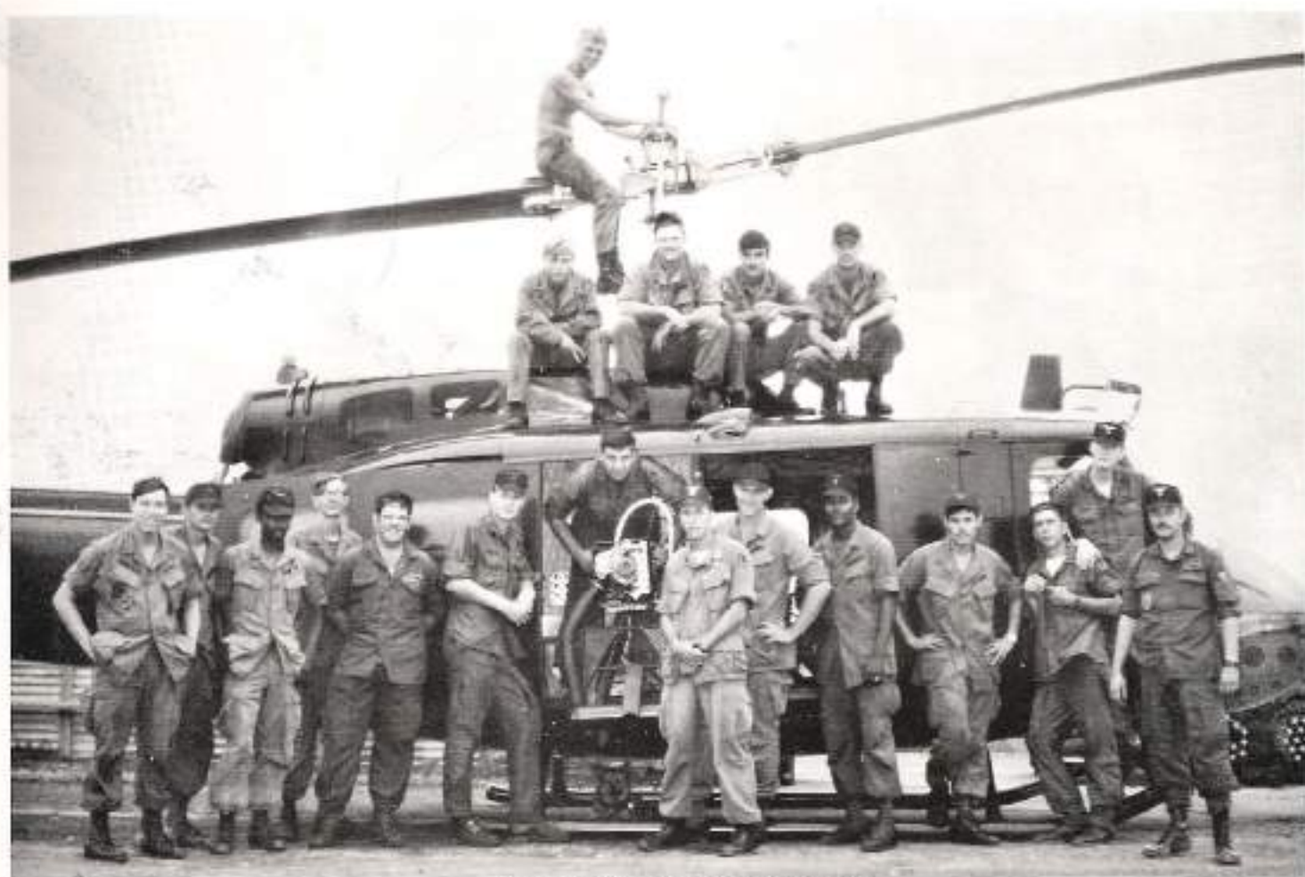
Meanest Muvva's in the Delta