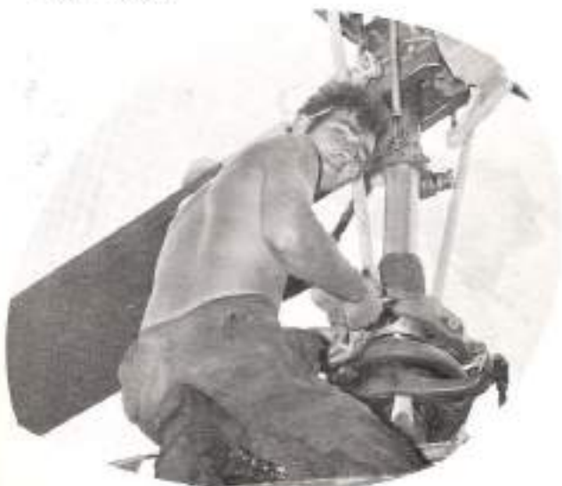
Den't look, I'll fix it.