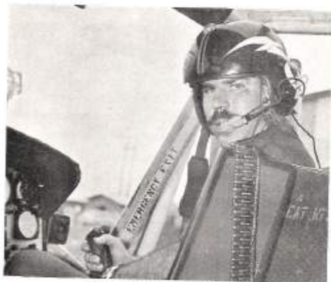
Infiltrated by the 114th