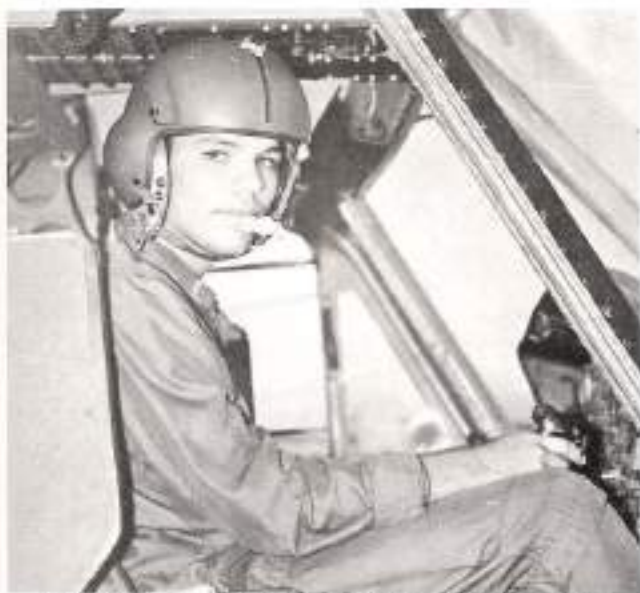
And what's wrong with going indefinite?