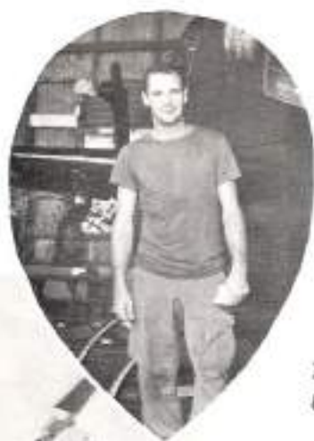
Beech-nut is not gum!