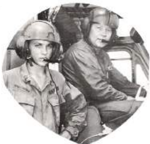
Sphhhh, Mack, your fly is open.