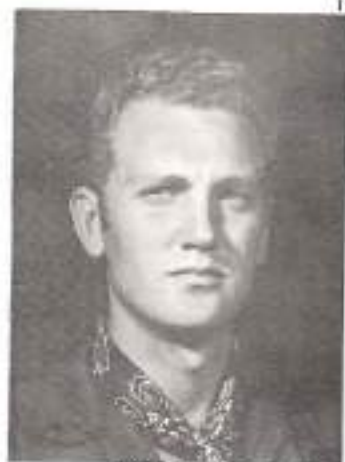
SP5 HUNPER 184