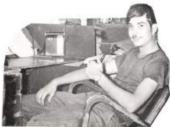
What? Me worry?