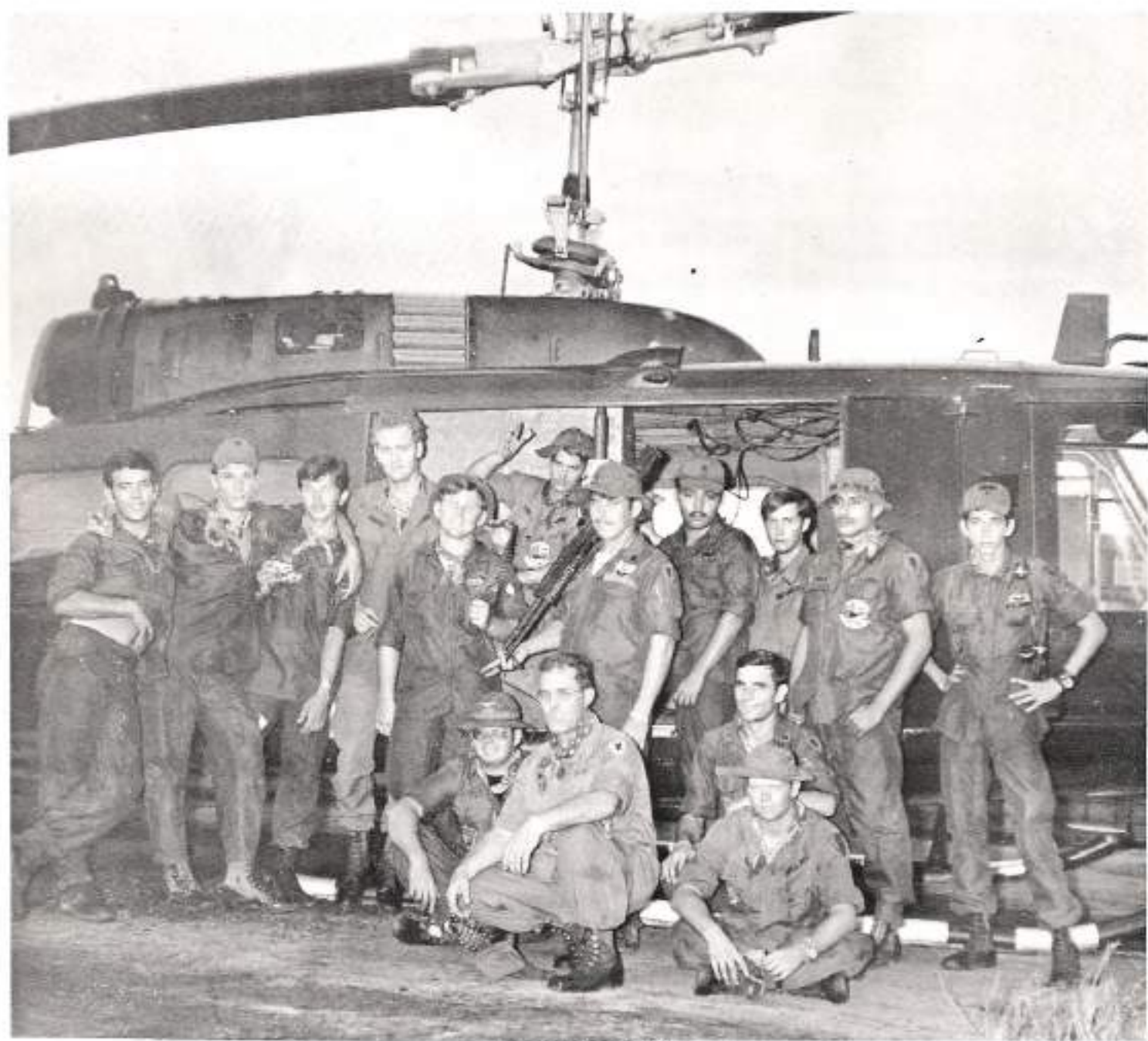
1st Platoon Crew