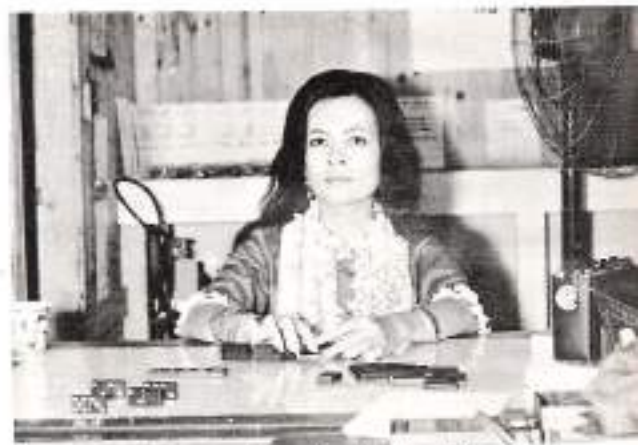
Hurry, I quit at 4 o'clock!