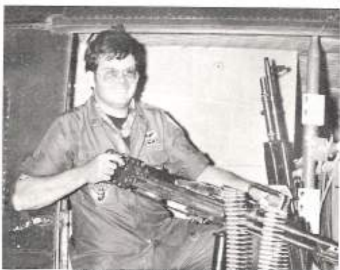
Everything's always orange.