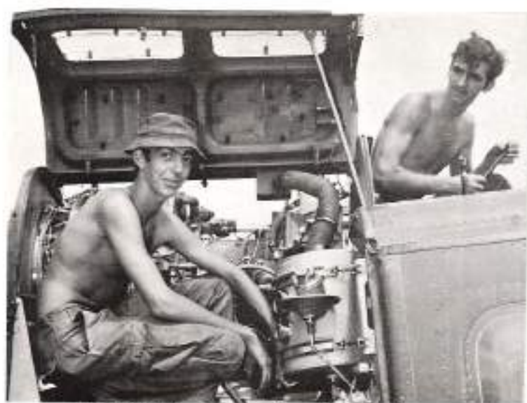
Not enough room to lay down here.