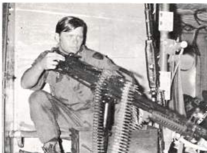
It works this way too.