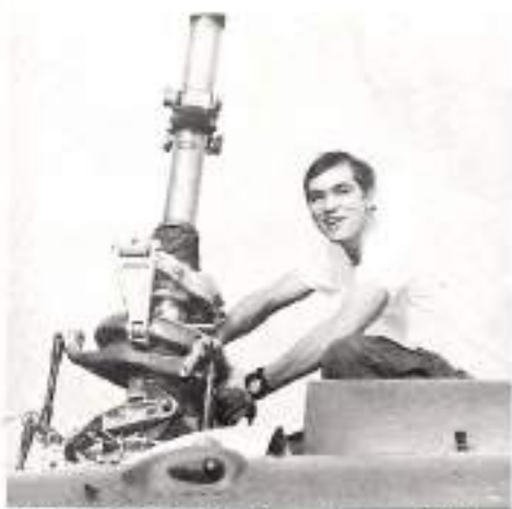
Everything checks out real fine. You can take it up now, sir!