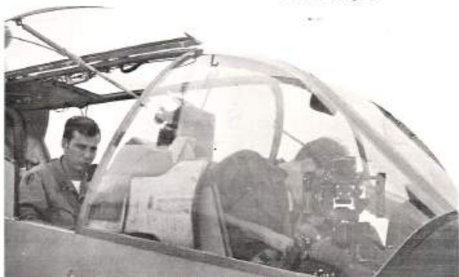
You broke what ???