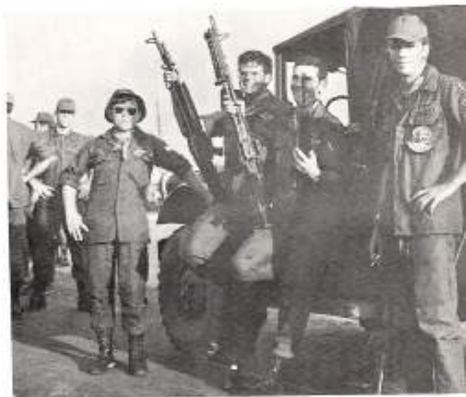
Would you believe a "Gun-on".