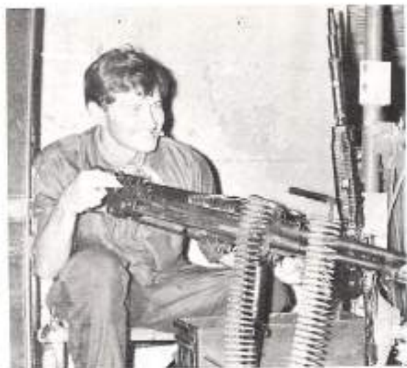
When my gun smokes, I smoke!