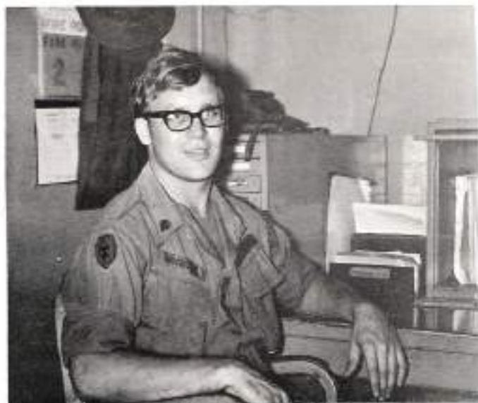
I am trying, sir!