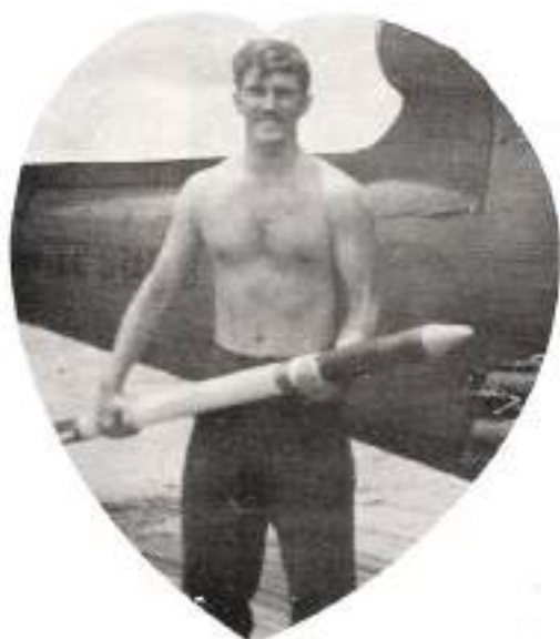
Feeding the Snakes.