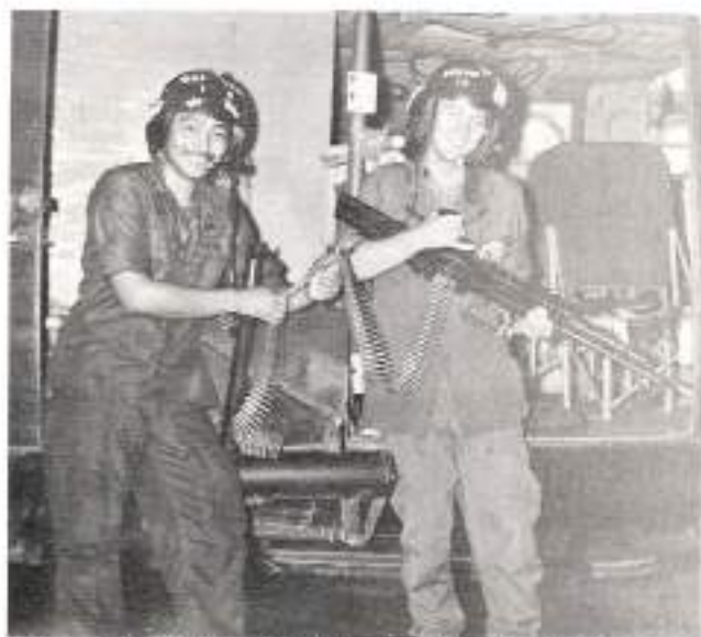
You hold it your way, I'll hold it mine.