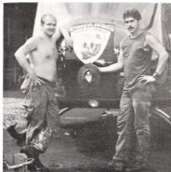
You mean I can't wear my boony hat no more.