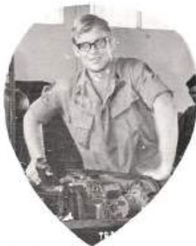
Don't ask me - if I knew.

Somebody help me - I don't know what I am doing.