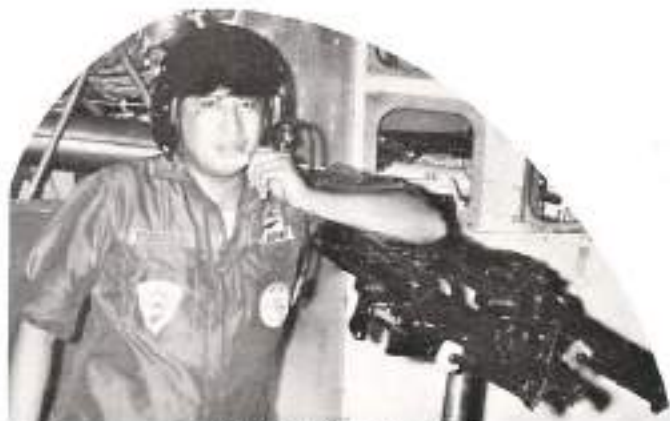
Feather in you cap