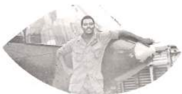
Why Piss, ofcourse