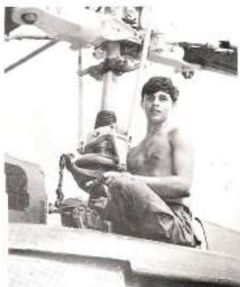
Damn those malaria pills!