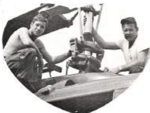
"Checked & found okay" Go ahead & fly it!