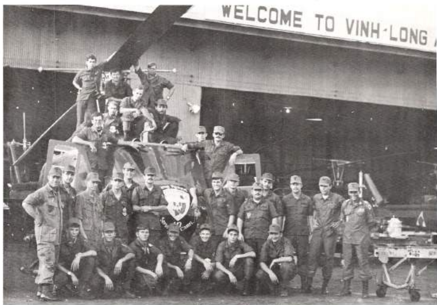
What keeps them flying?