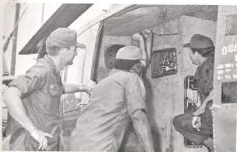
I will never start by cranking it here.