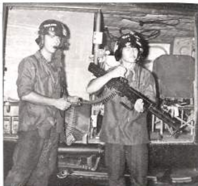
We always kill with a smile on our face.