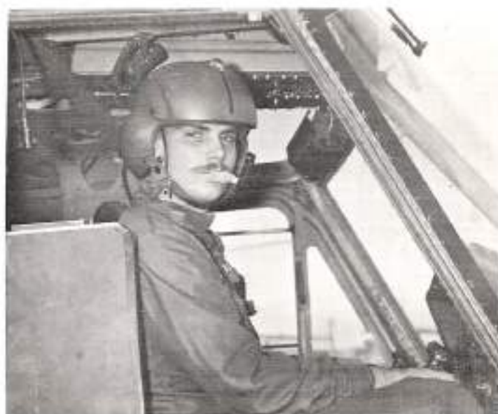
This isn't a cyclic.