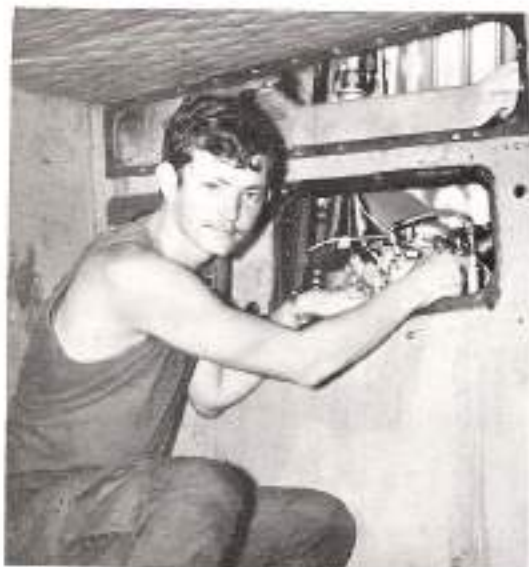
What do you mean do it over again?