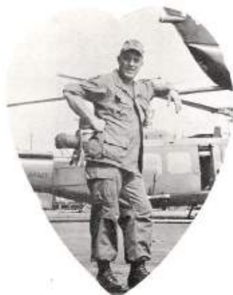
God! I love this.