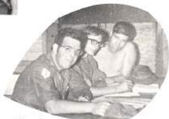
Come back in an hour, we're busy right now.