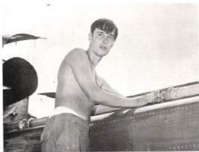
What is a tongue wrench?