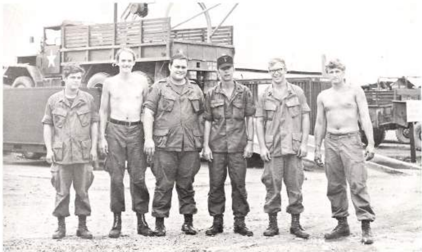
Crazy Grease Monkeys