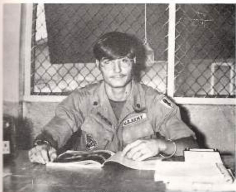
My job? Well....