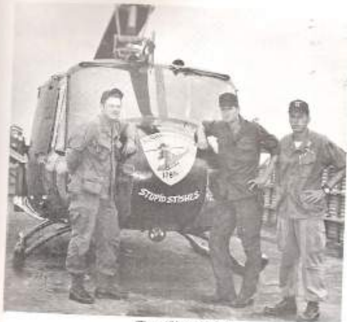
The "Main" men