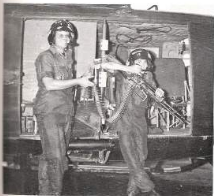
We take our job serious too.