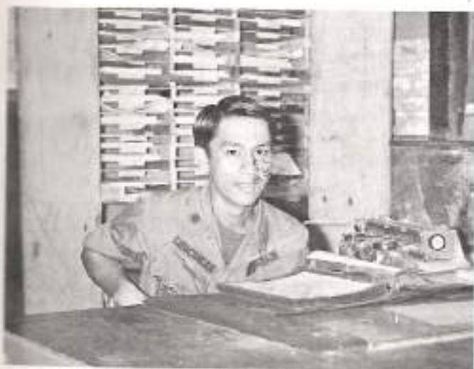
I told you there is no mail.