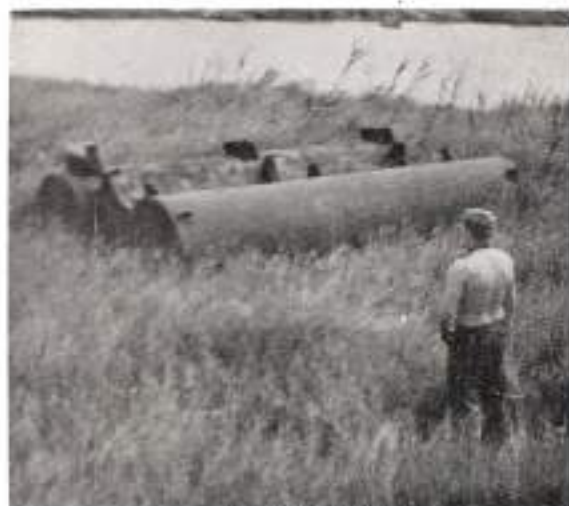
.....on this place!