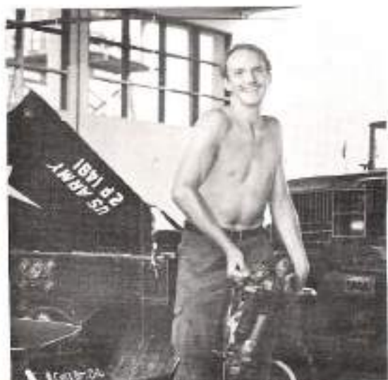
Gee, non, it's not heavy.