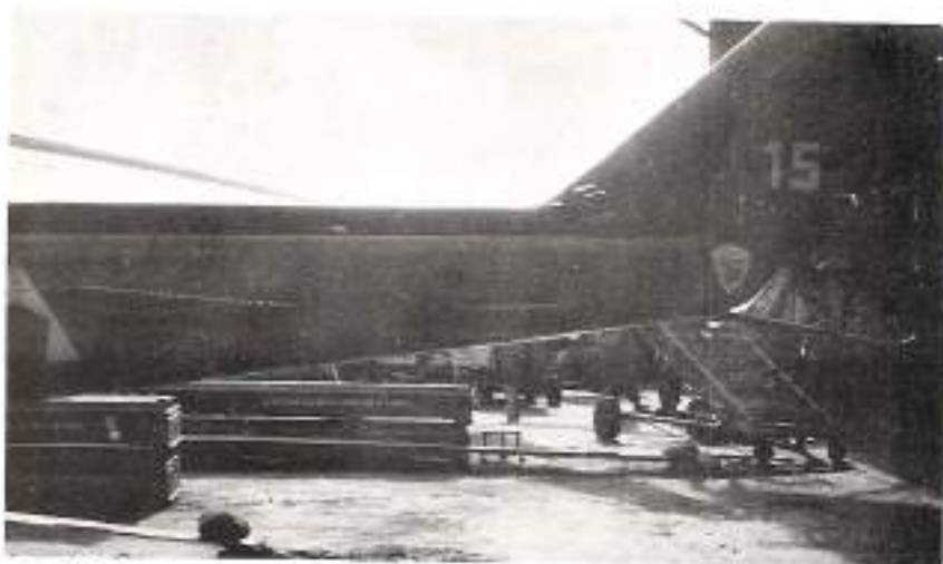
I know you are in there. Lets go! We got a formation.