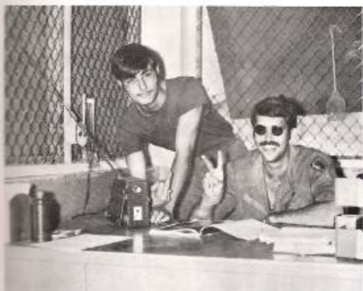
What's one and two?