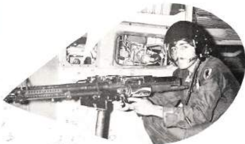
I'm not sure what platoon I'm in.