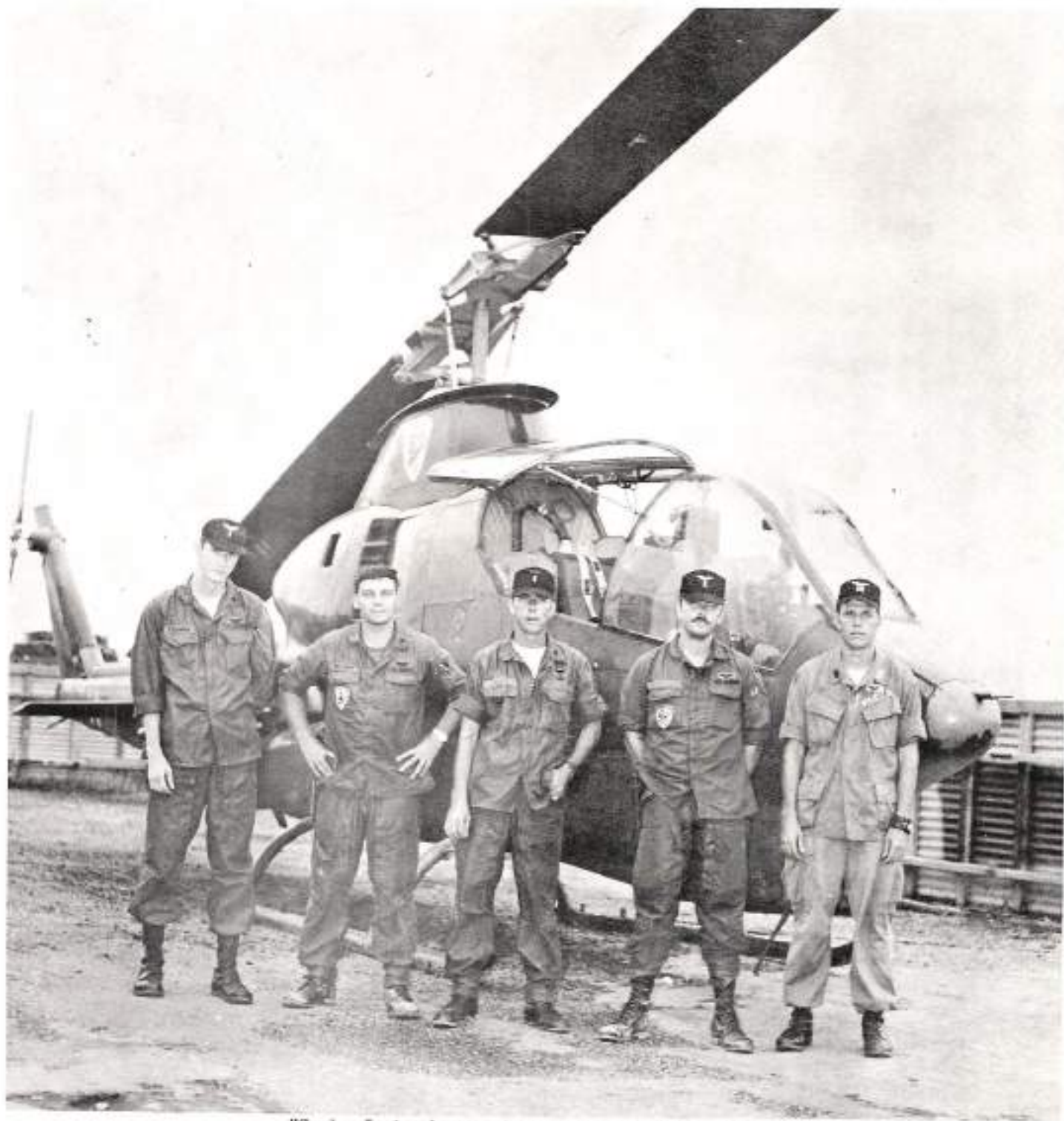
"Snake Jockey's are too mean to smile". AR 95-1