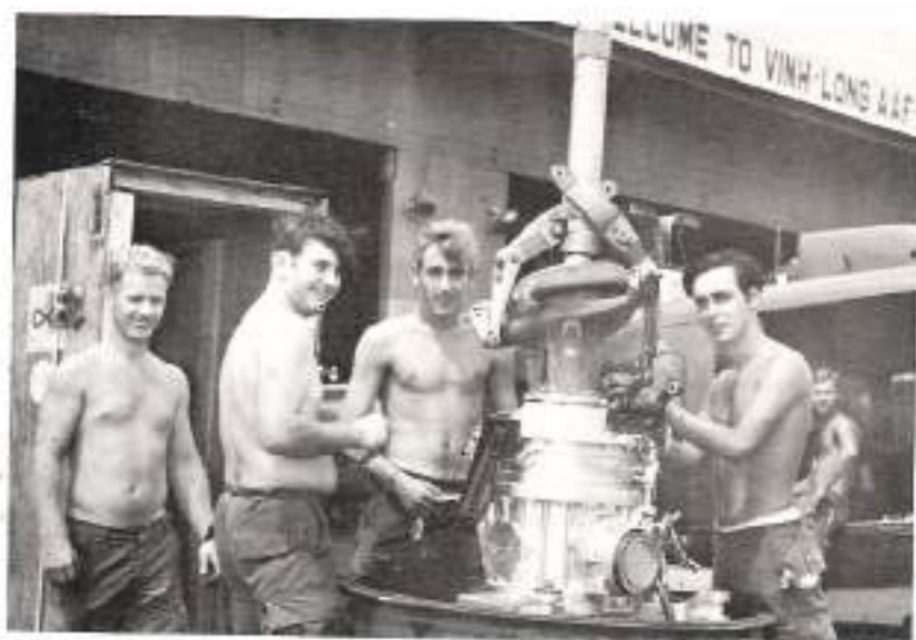
Who and what happen to this?