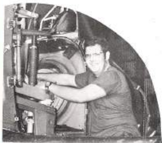
Sure feels good.