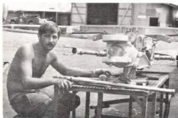
What do I do now?