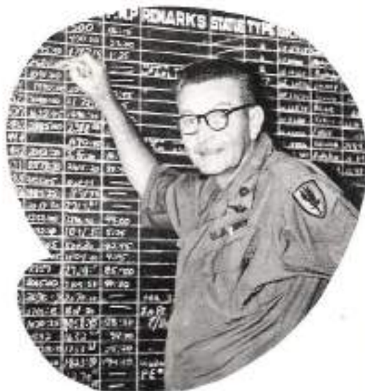
How when I change this number everyone will be confused.