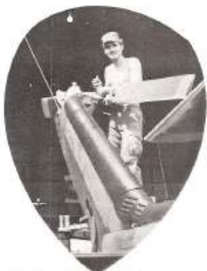
Just a little tighter should take up that play.