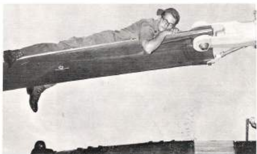
Something about a warm blade.