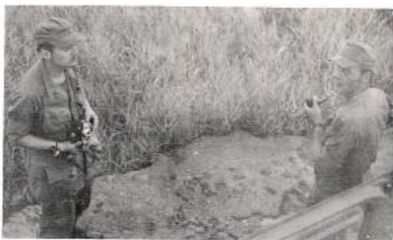
Now, you take the camera and I'll take the pipe.