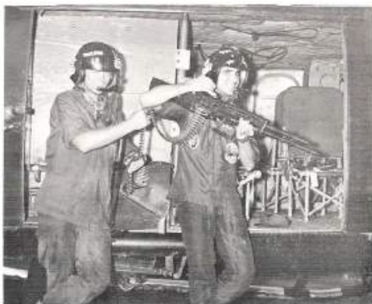
1st Platoon song & dance team