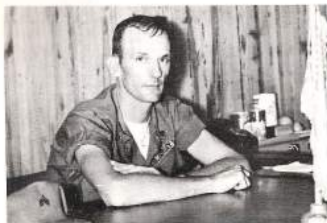
I'm not going to work till I get my Bronze Star!