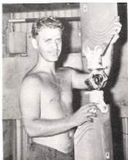
And how are you fixed for blades?