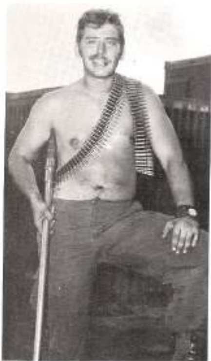
What did you do during the war, Daddy?