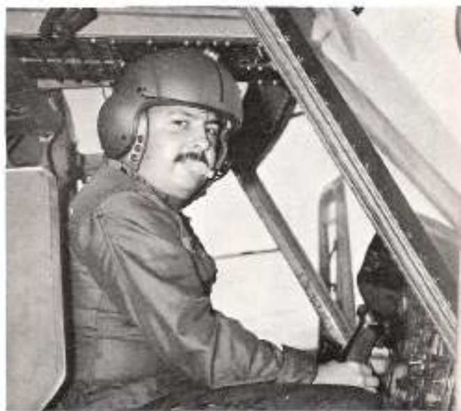
What's in my hand???