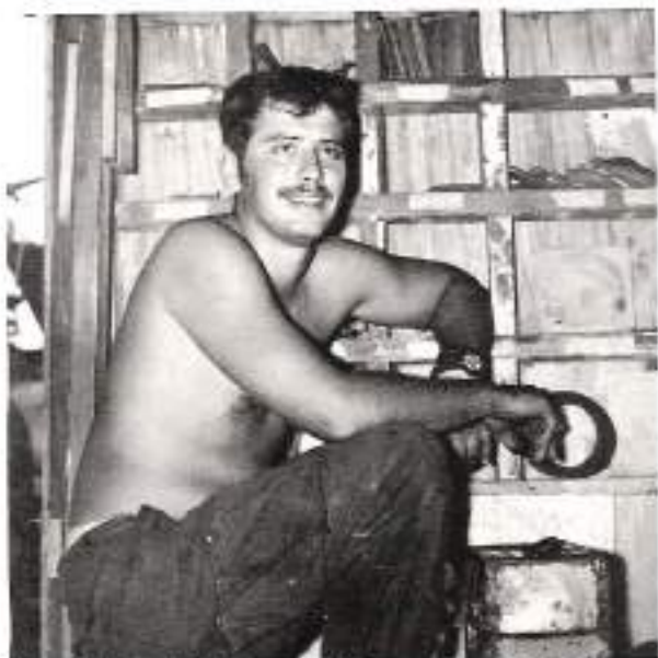
I think I'll go back to the club.