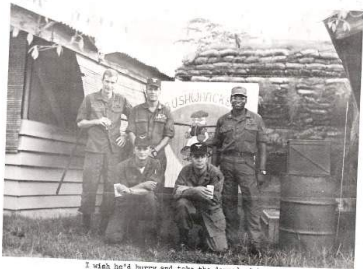
I wish he'd hurry and take the damned picture.