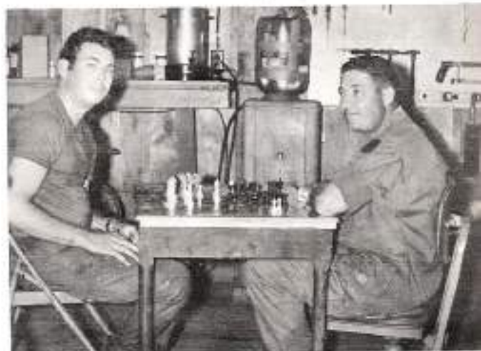
Got all your work done "74", keep quiet & Nop!