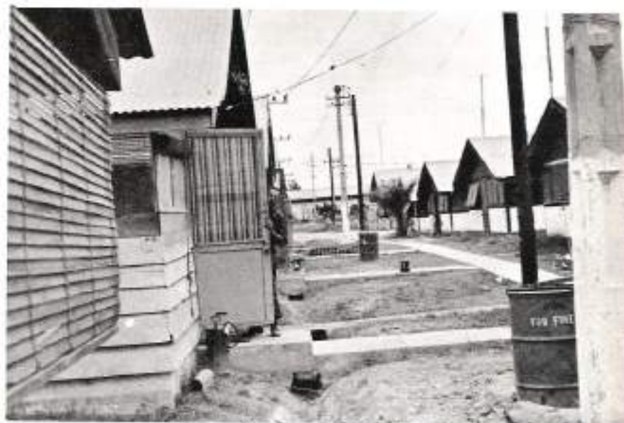
I guess I told him.