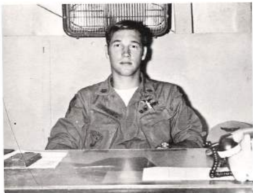
Keep it behind your back until they leave.