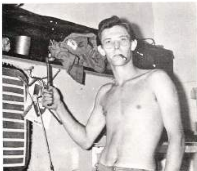
And this is what I'll hide in the engine inlet area.