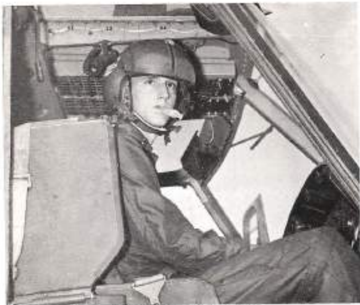
Dedicated slick pilot