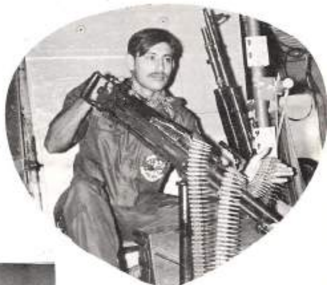
Double your trouble