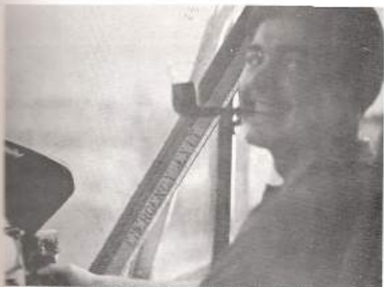
Just one more toke, and I'll do the morning report.