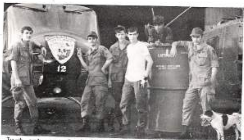
Just act normal, he'll never notice the main rotor.