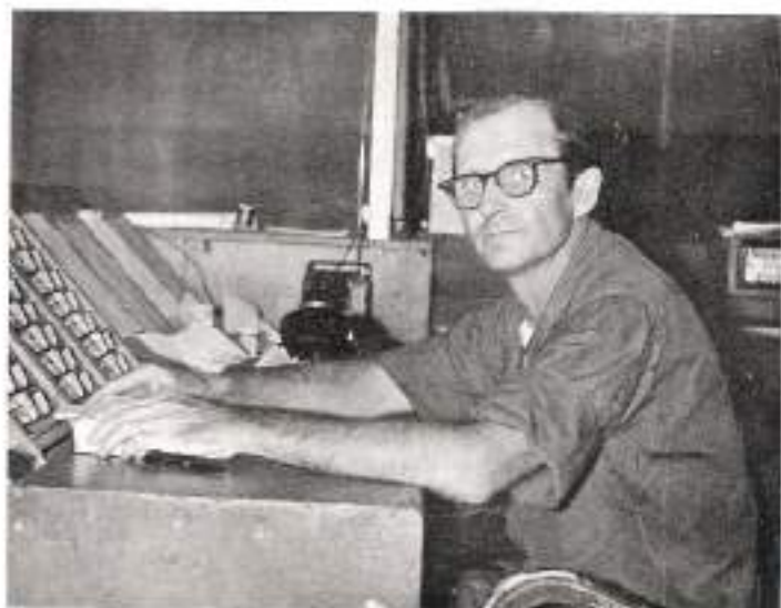
What do you mean they ran out of transmission?