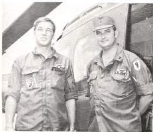
I could have sworn that was a crane.