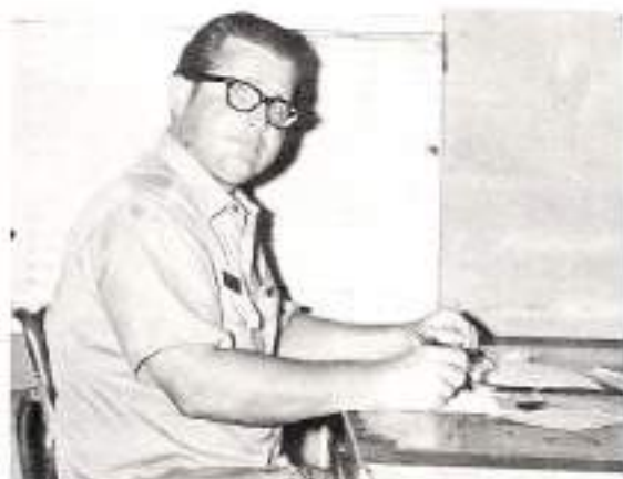
I look busy anyway.