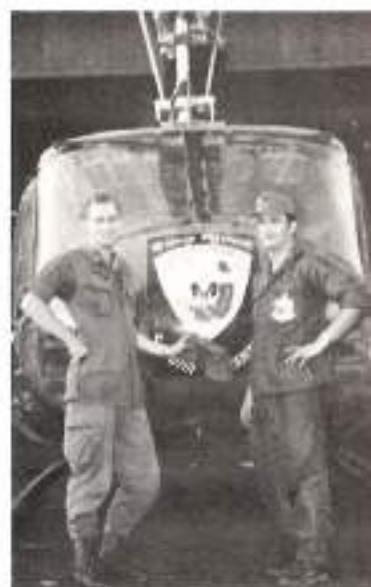
Some things are better hidden.