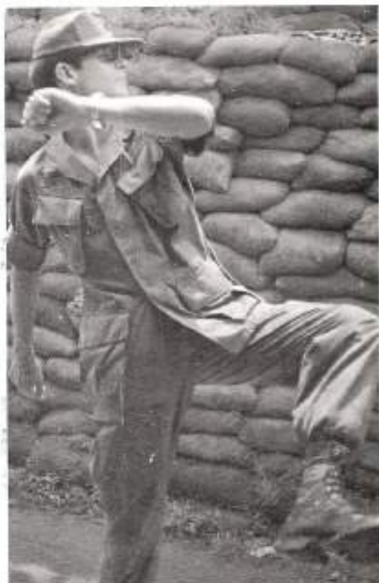
Keep on truck' in BTs!