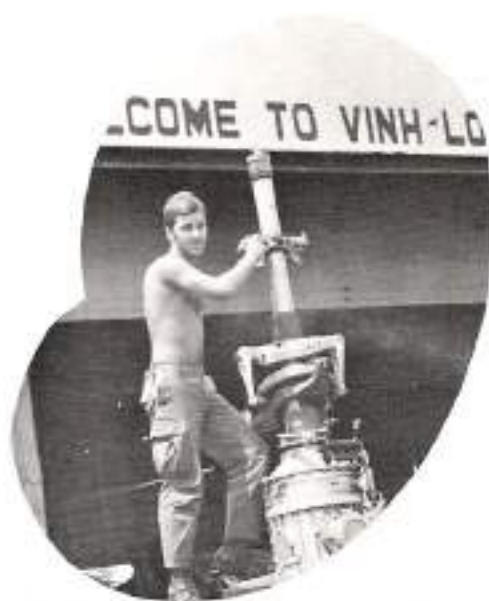
I thought that price was mighty cheap for a whole Huey.