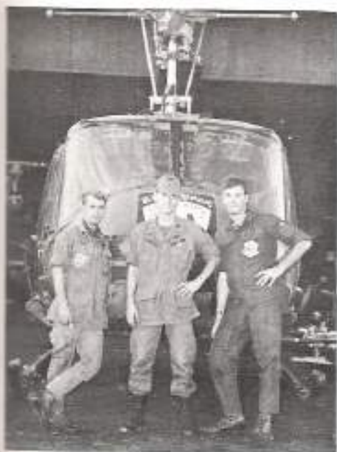
Pick the AC.