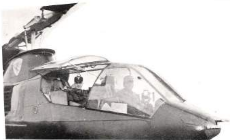
Six and six