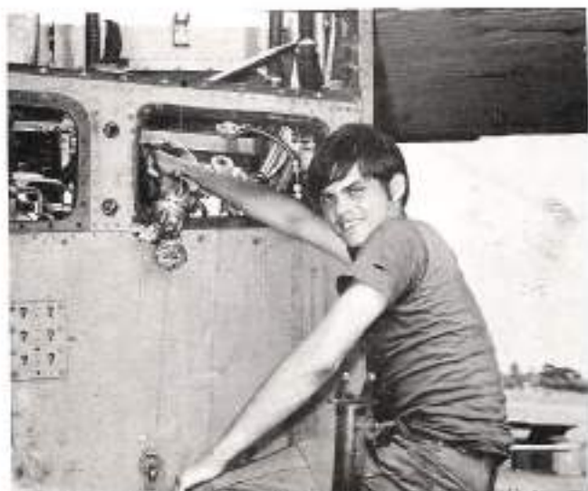
Somebody held a finger on this while I tie it on.