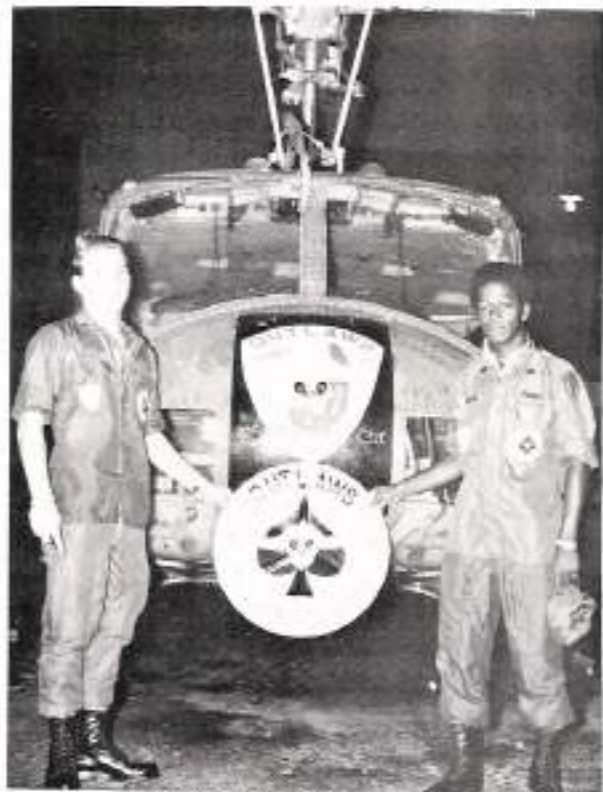
Black and white picture