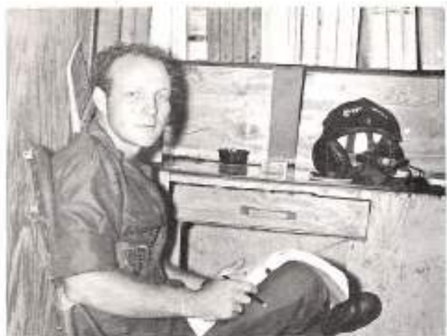
Looks impressive, doesn't it?