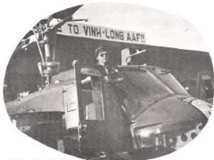
Yup, I'm a door gunner, and this is my door.