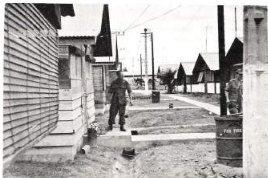
I'm not gonna be the ISG.