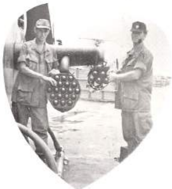
From Ammo - with love