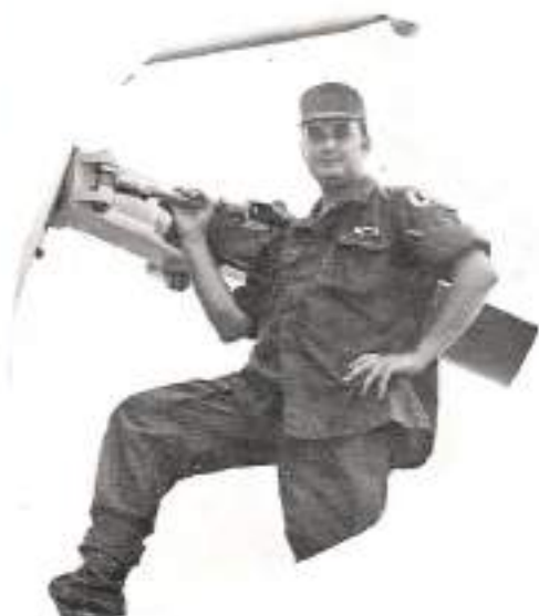
This thingamejig in my hand holds the whatchamacallit on, I think?