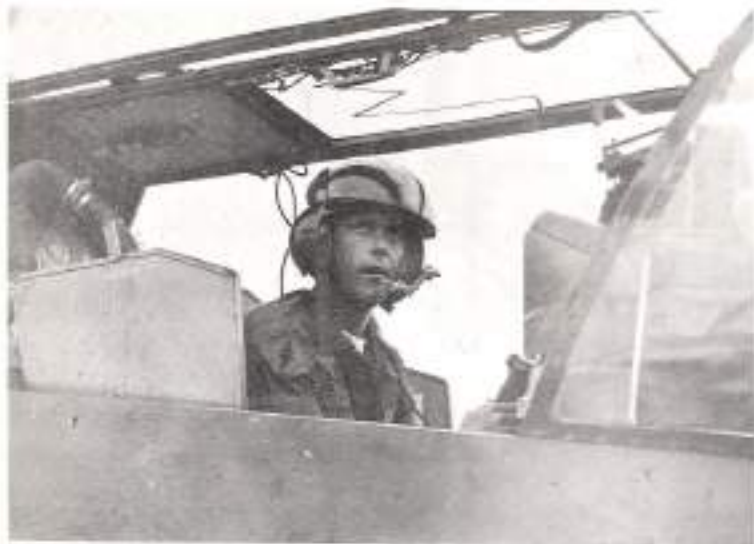
I wonder if no blade is Red X. Buzz.