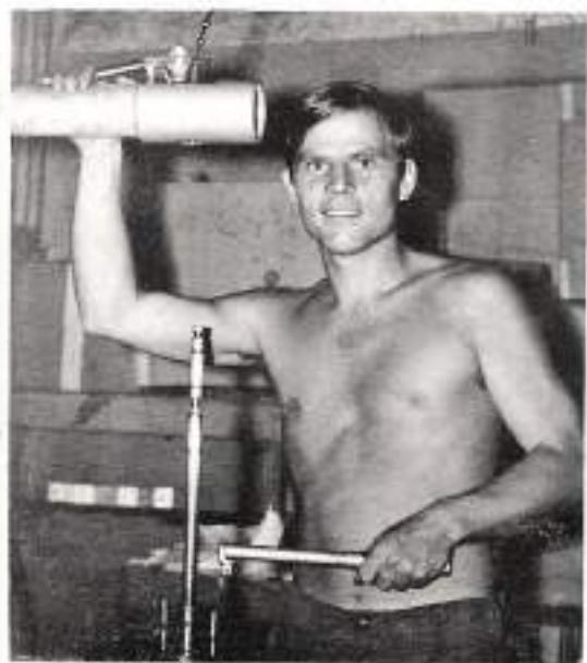
Is it inch. lbs or foot lbs?