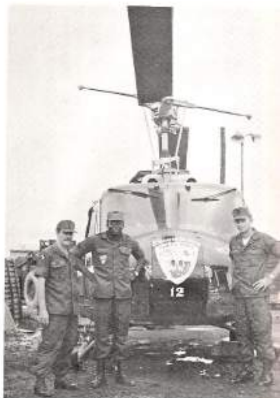
OK Top! You drive.