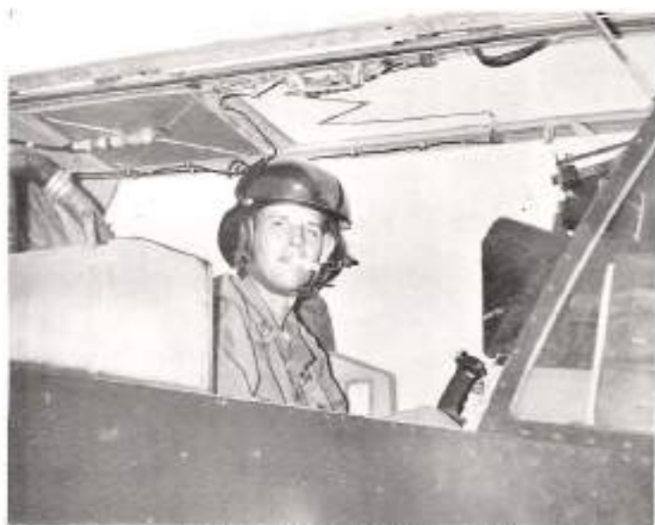
Have I got a deal for you?