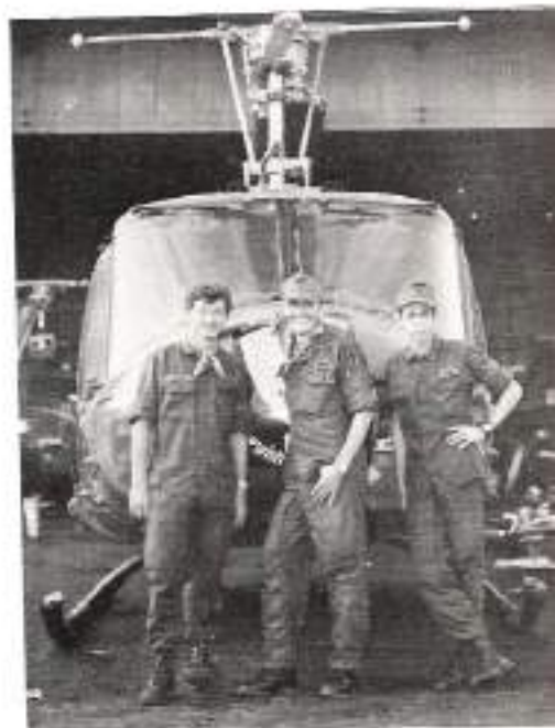
Another picture of masser