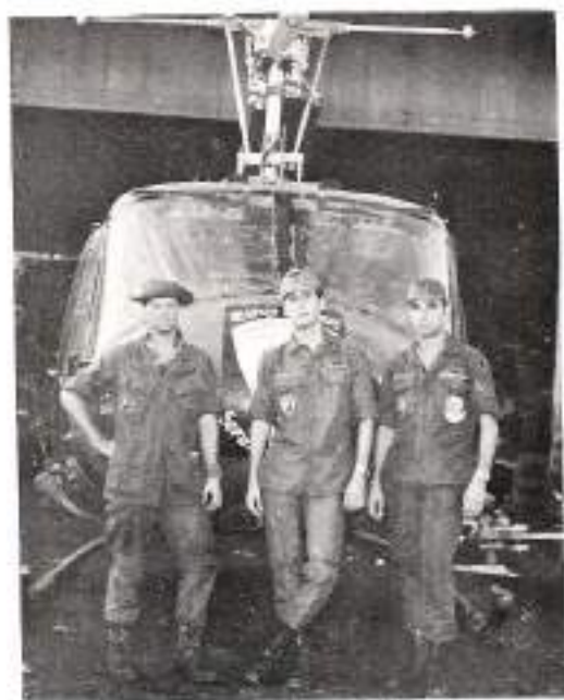
Raccari and boys