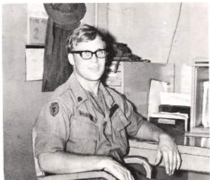
Well, well, well, what have we here?