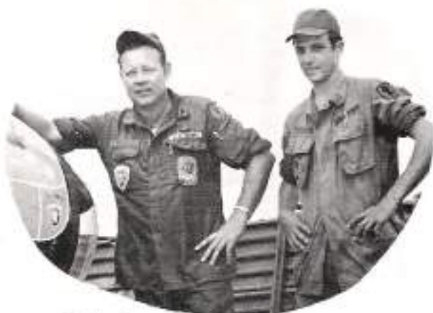
Let's throw him in the Cobra Pond.