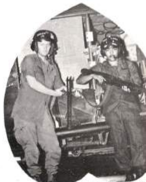
There are ways to change your mind.