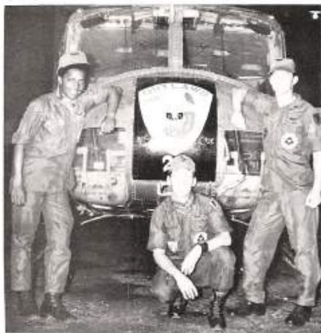
....and for Charlie Brown.