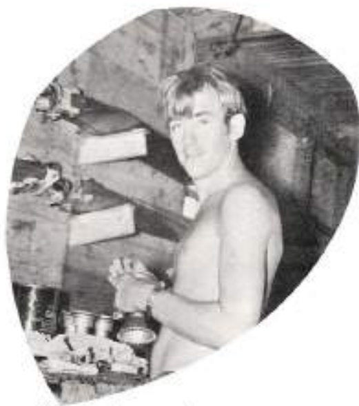
Oh, what a mess!