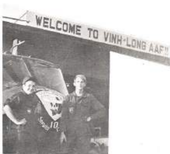
Don't believe it for a minute!