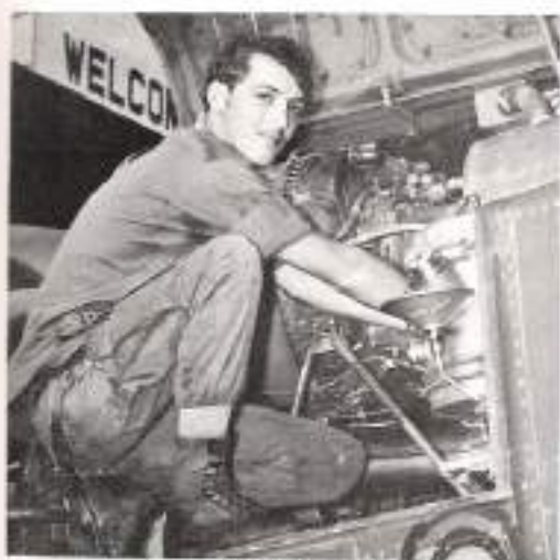
Take me to heart