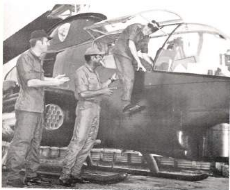
Now place the other foot here, sir!