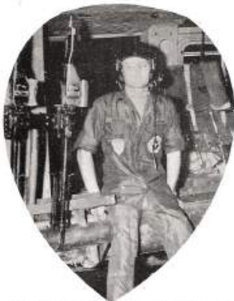
I've killed for less than that.