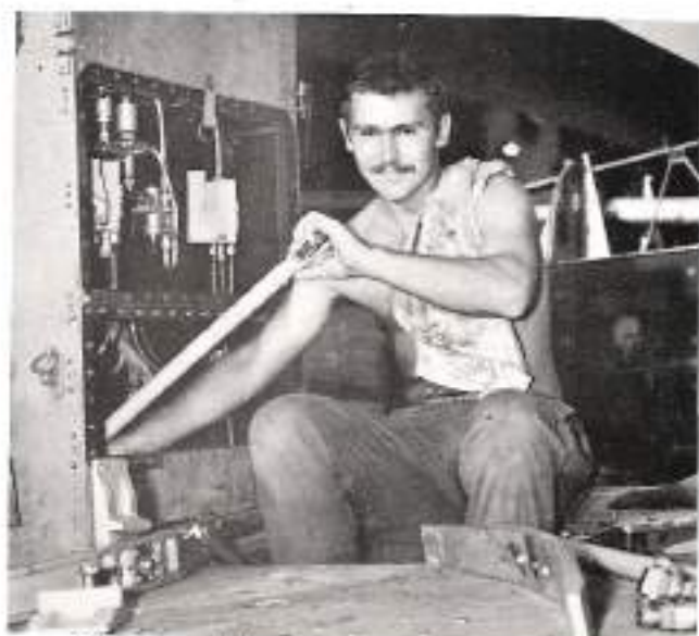
Those pilots will have a hard time figuring this one out.