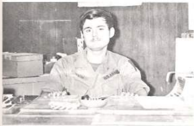
OK, I'll play your silly game; where are your orders?