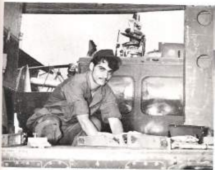
I don't find it.