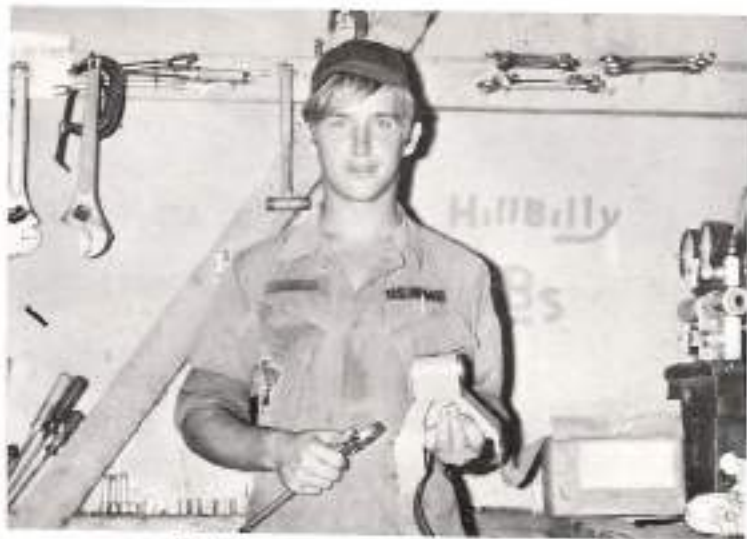
Which one is DUH wrench, Sgt?