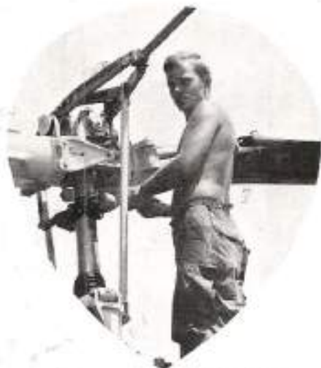
Are you sure this is the right side?