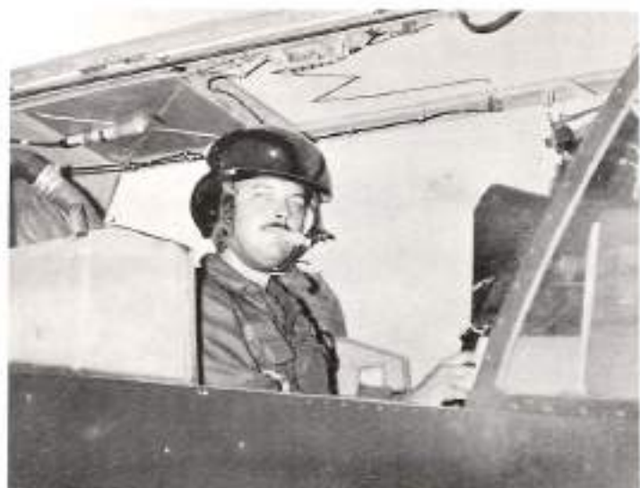
No, I won't fly at night.