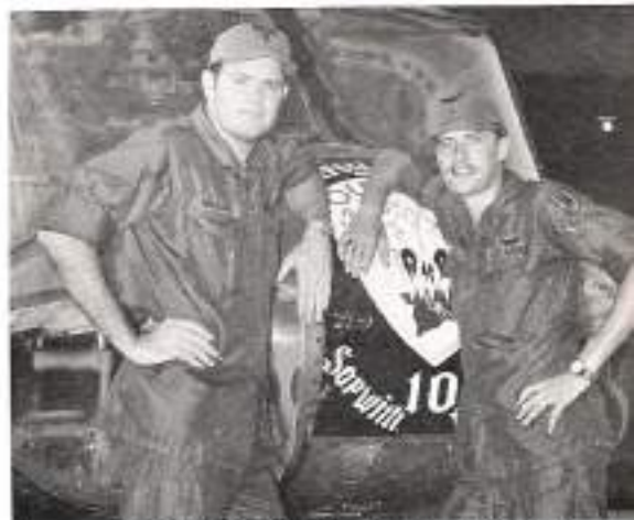
A DFC for being from montana?