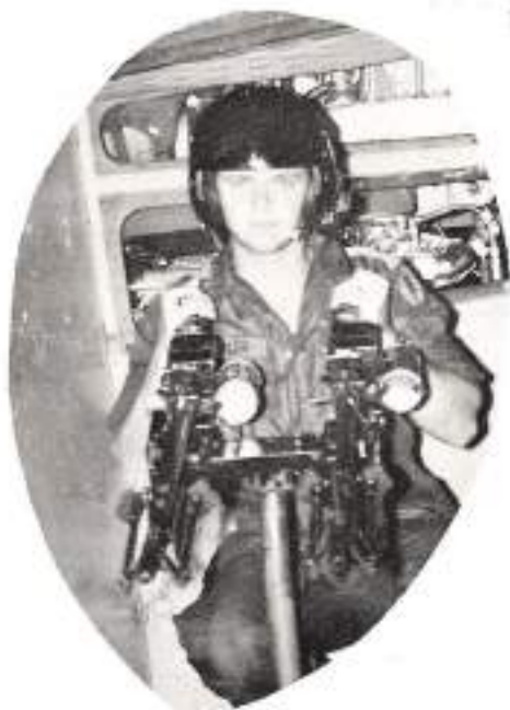
They work until the cans fall off.