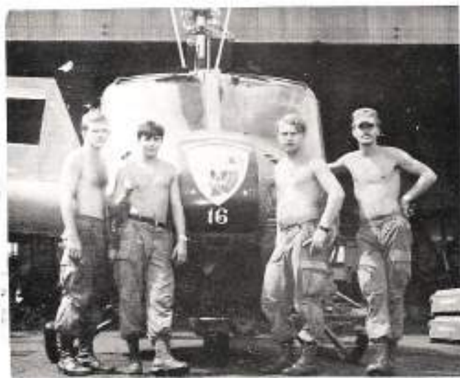
Where is Muscle Beach?