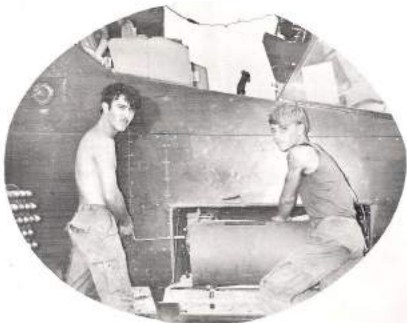
Say again - All after "Crank"!