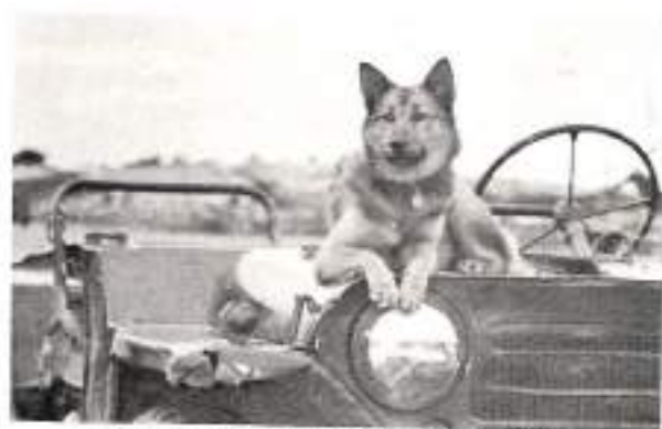
"Sheila" * Bushwhacker 3 -Dog