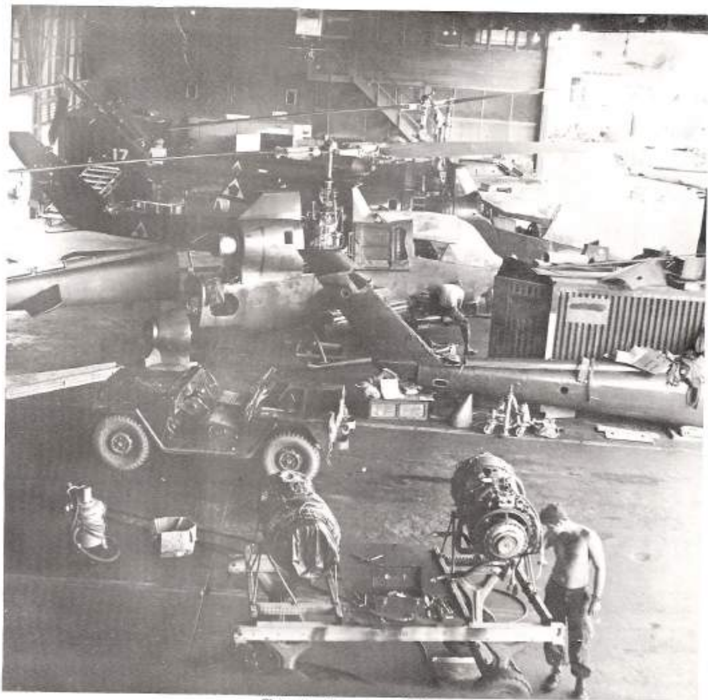
This is where we worked, men.