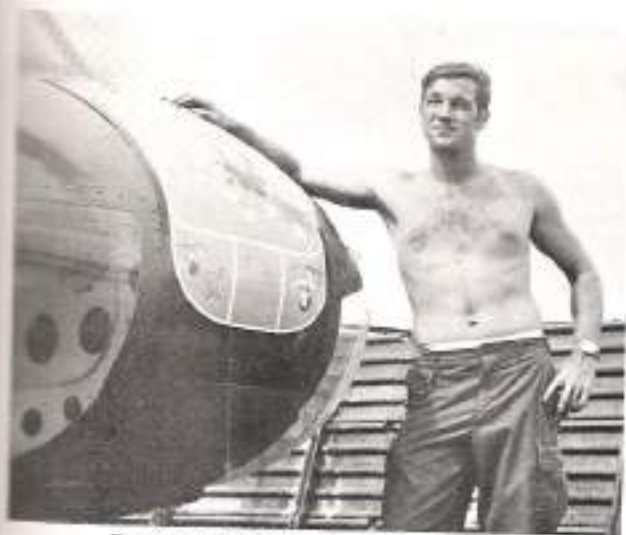
It is awful hot and sunny.